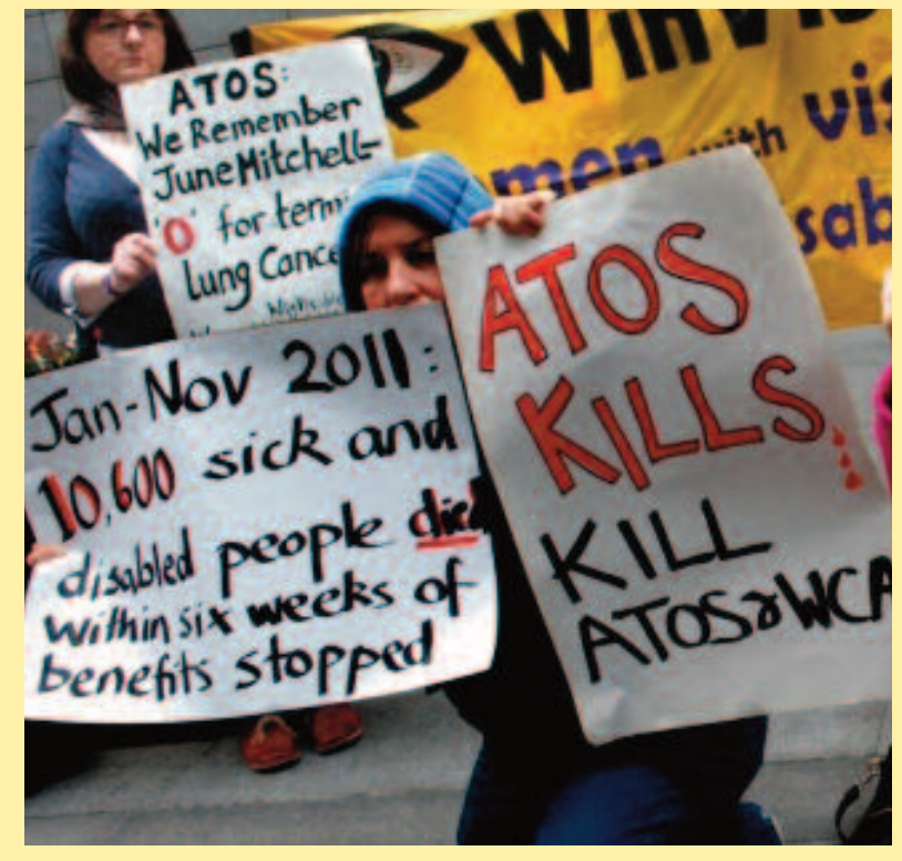
Anti-Atos day of action, 19 February

relations strategy cynically portrays disabled people as the aggressors, and themselves as the victims.