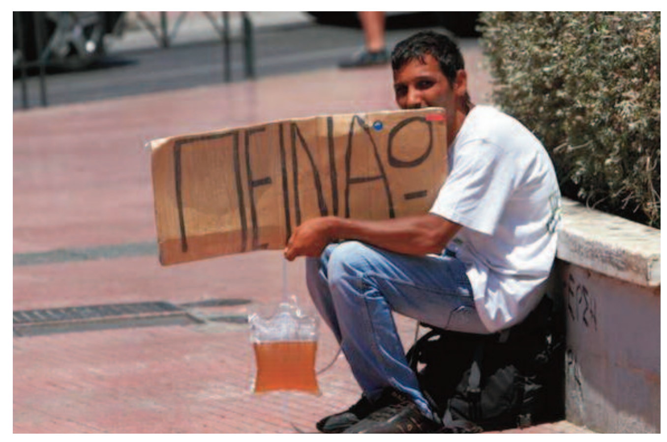
Poverty and inequality on the rise in Greece

But the Marshall plan was a plan to reconstruct capitalist Europe as a buffer against the "communist threat". The mod-