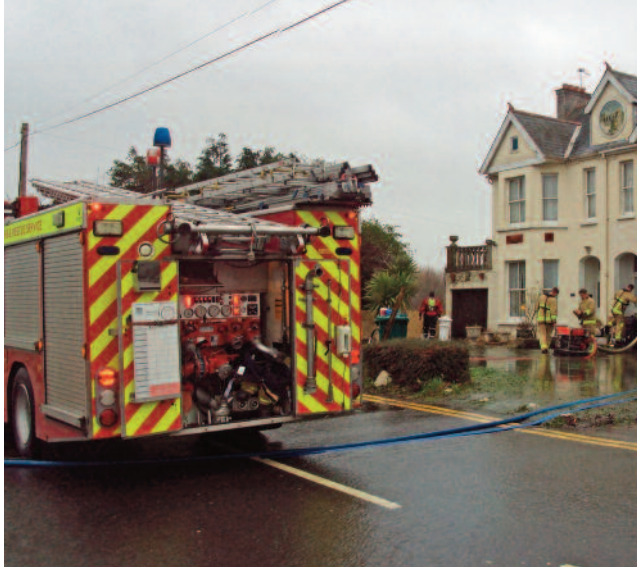
Volunteers and firefighters at work. Fire services in Surrey, as elsewhere, face cuts.

Everyone contributed what they had — equipment, food, labour power — and everyone took what they needed from