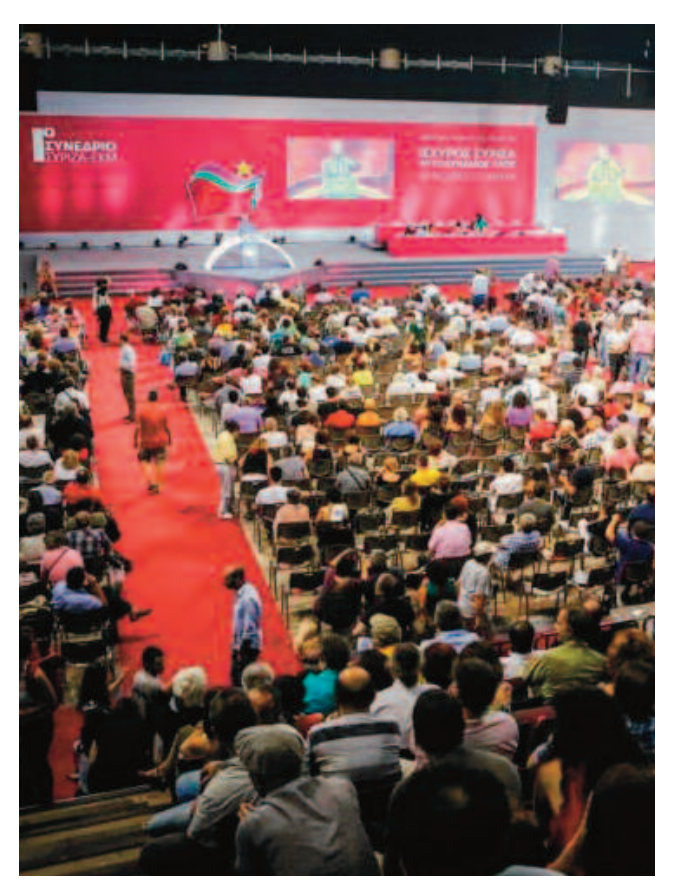
Syriza conference in July 2013 moved from a federation to a single party

These procedures disrespected and bypassed the organs and structures of Syriza. In many cases the candidates' names