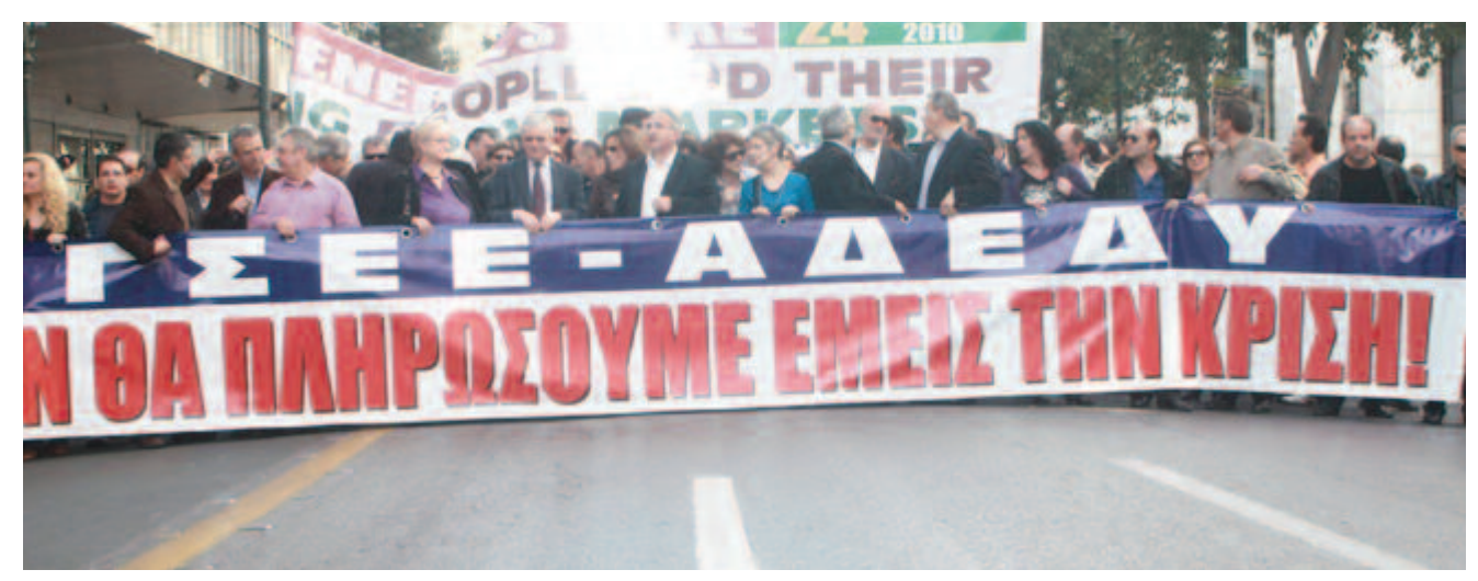
GSEE-called strike should be the beginning of a battle plan