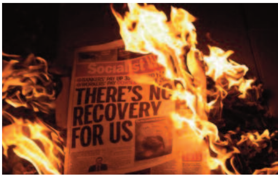
At Sussex University, some students have tipped over SWP stalls and burned copies of SW that SWPers were offering for sale

The ISN was started by people quitting the SWP, and has