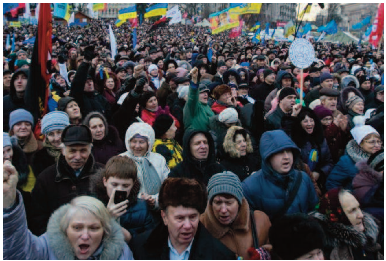
Protests in Ukraine began in November 2013 after the government of Viktor Yanukovych abandoned plans for closer ties with EU