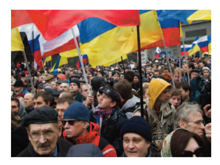
15 March Moscow demonstration against Putin's policy in Ukraine

The claim that fascists control Ukraine is propaganda by