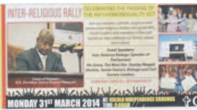
Inter-religious "celebration" of passing of the law

fear of being identified and attacked in the street.