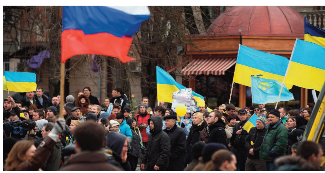
Russian supporters and Ukrainian supporters meet each other in Simferopol, Crimea, before Crimea was annexed by Russia

When we talk about the "Third Camp" that means always trying to develop movements of organised workers and op-