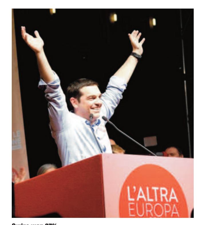
Syriza won 27%

Neither with the euro nor with the drachma with there is