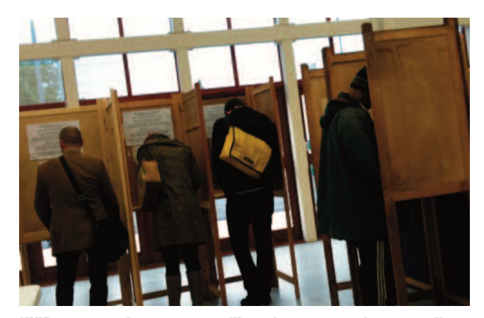
UKIP voters and non-voters will not be won over by pretending they are just "pissed off"

I think this is dangerous wishful thinking that ignores ideology. Neo-liberal, pro-austerity and anti-migrant ideas are