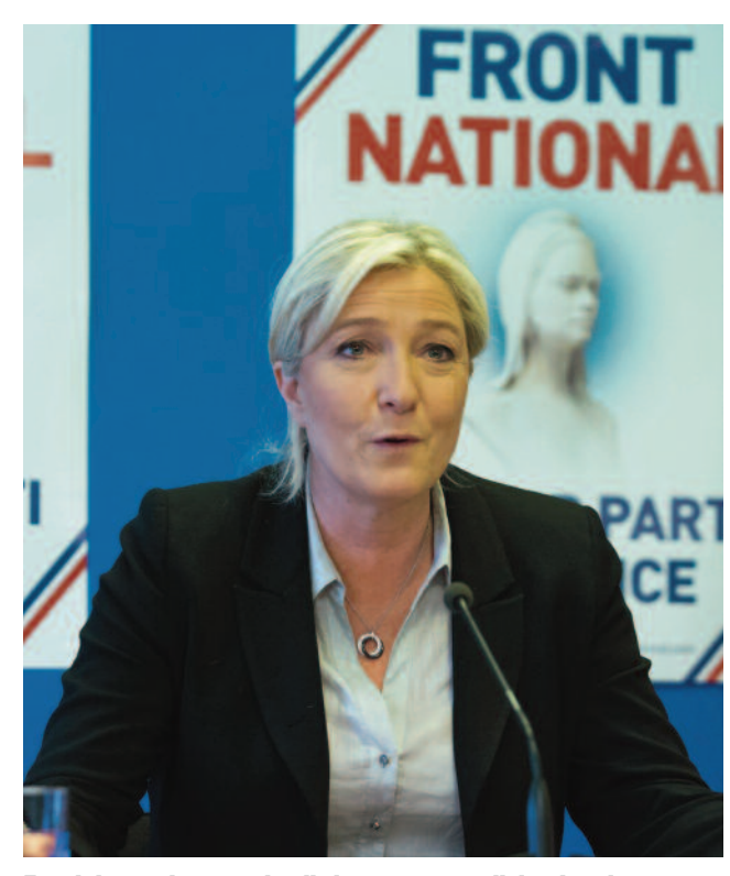
Far right parties promise little except penalising immigrants

Migrant workers contribute disproportionately to the public services and housing construction which xenophobic myth portrays as "overstretched" by migrants. Areas with fewer migrant workers generally have lower wages than those with many. Migrant workers are an enlivening part of the potential for a working-class fightback against the bosses and bankers.