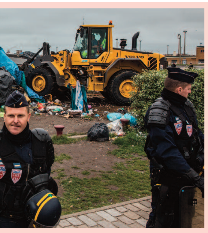
g three campsites housing up to 800 migrants in Calais. This came poll in European elections and in a district, Pas-de-Calais, where the

n outbreak of scabies in the camps. Where these migrants, who have not our concern, say the authorities.