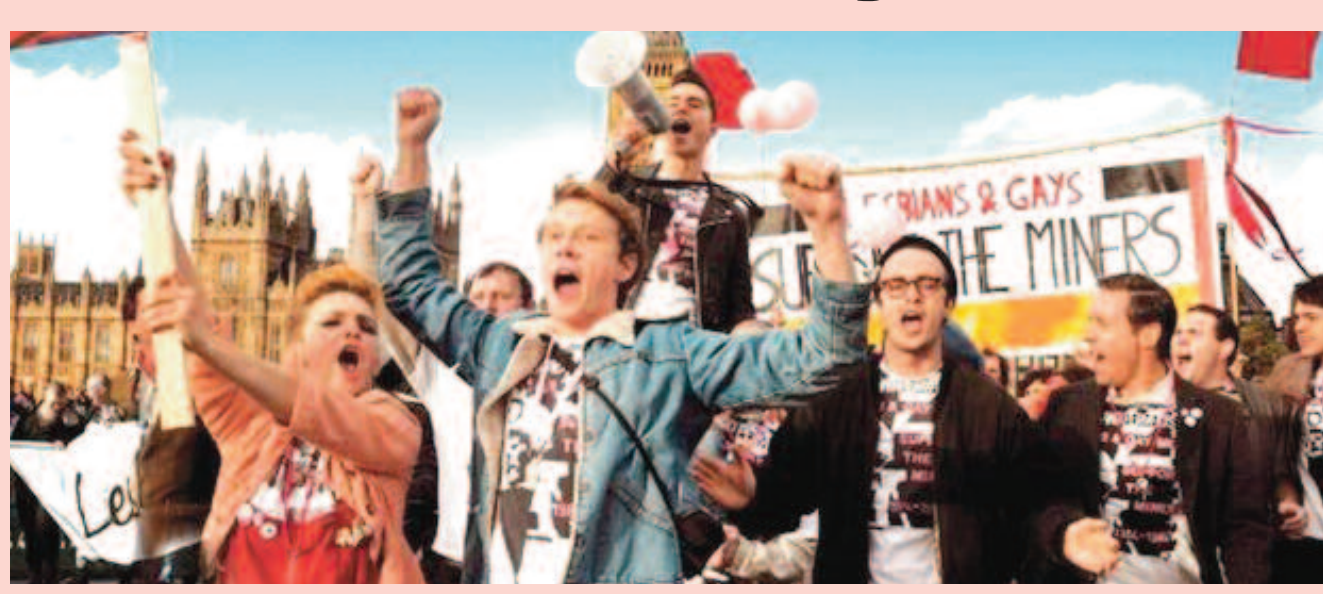
Lesbians and Gays Support the Miners, as depicted in the film Pride