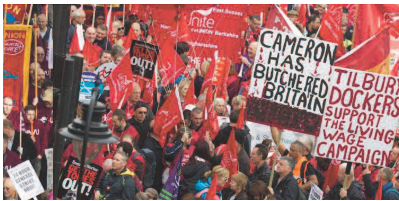
We will win more by fighting together

The Scottish National Party promises that in a separate Scotland the NHS will be safer and the Trident nuclear submarines will have to be moved to England.