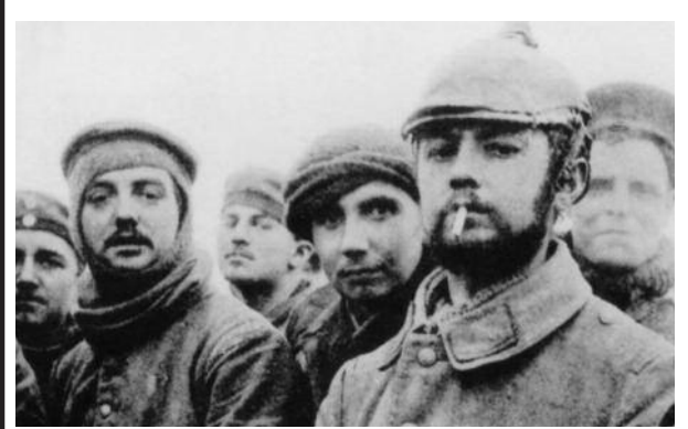
German and British soldiers together on Christmas Day 1914, during a temporary ceasefire.

Brothers, arise, whatever be your nation, Hungarian, Frenchman, Danish, or Alsatian, Whate'er your colours, whatever be your land. Instead of lead shoot forth the brotherhand. And mimic warfare let us hasten toward, And from their troubles all our people free, Those who want war let them alone go forward -A freedom soldier I will gladly be.