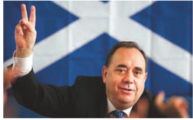
What would the SNP deliver?

If Labour wins the (all-UK) general election in May 2015, a resulting Labour government will be a lame-duck administration from the start. It will be set up to fall in March 2016, or whenever separation comes, because it will lose its majority with the loss of MPs from Scotland.