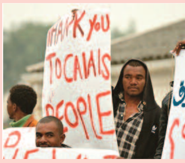
Migrants oppose fascist demo in Calais

spond to the right only by asserting that the scale of the migrant "problem" is not so great as imagined. We must respond by changing the terrain of the debate, and reframing entirely how the "problem" is understood