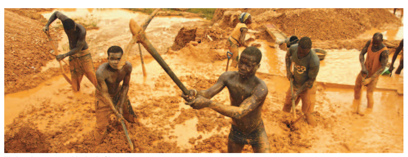
Workers in an open gold mine in Ghana

Each single gram of gold from the mine, will take ten thousand litres of water. In the Minas Conga area, an average campesina family will use 30 litres of water a day, in contrast to a small mine, which will use 250,000 litres of water in just one hour. One single small mine will use as much water in an hour as a local family will use in 22 years! And keep in mind there are multiple mines owned by Minera Yanacocha, the