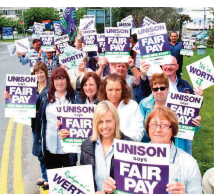
NHS staff staged protests about pay across Wales last June

strike days. Strikers' meetings will give workers an opportunity to discuss the dispute and make demands on the union leaders to call more action.