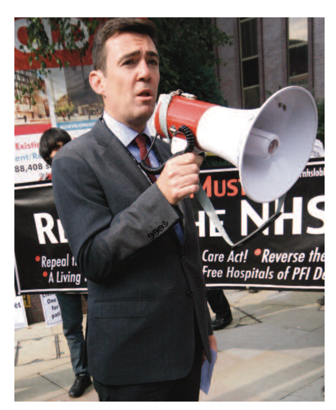
Burnham is pressured into addressing NHS lobby