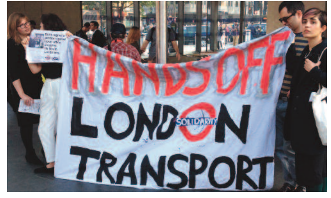
Hands Off London Transport campaign action on 16 September

A one-day strike would have little impact, but a Tube strike on 14-15 October could be effective if properly built for.