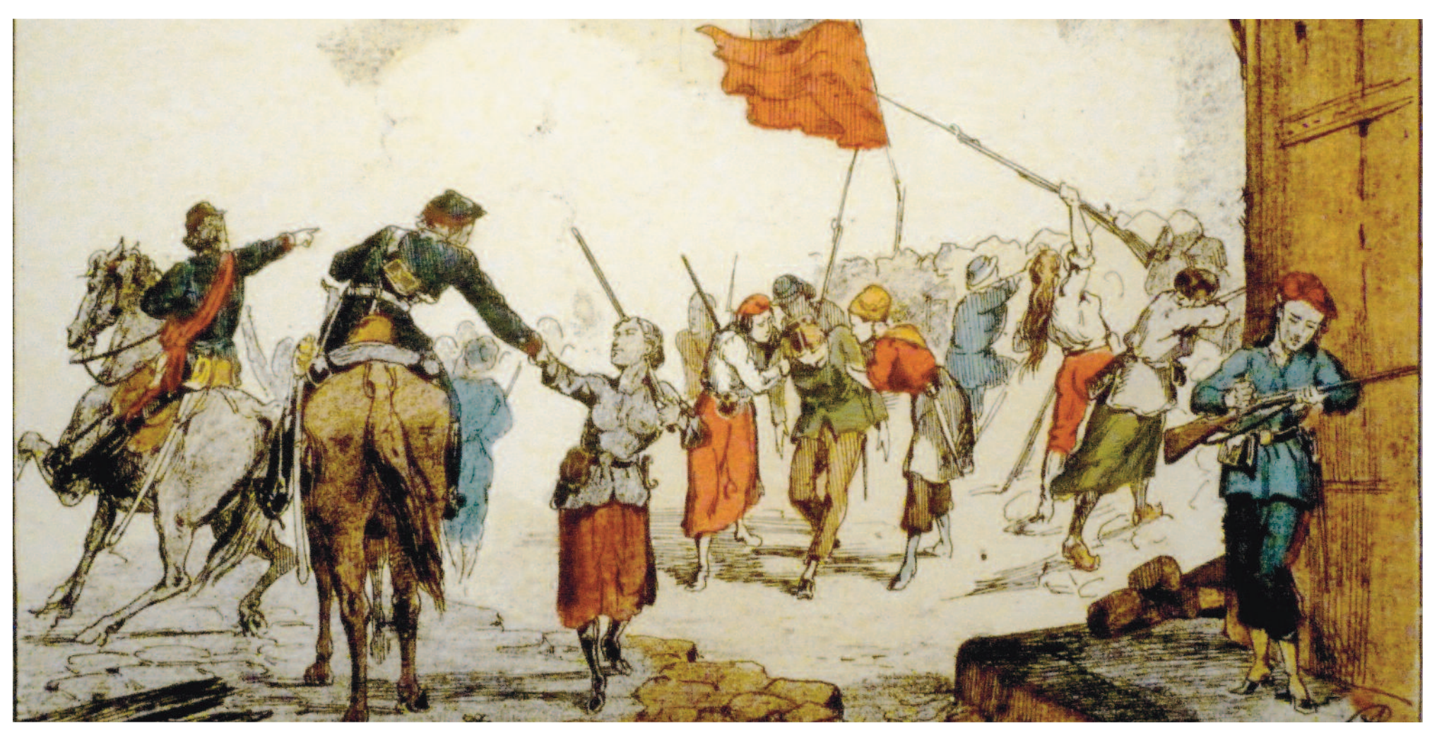
Communards defending a barricade on the Rue du Rivoli

Irish, who form a very considerable section of the working class here."