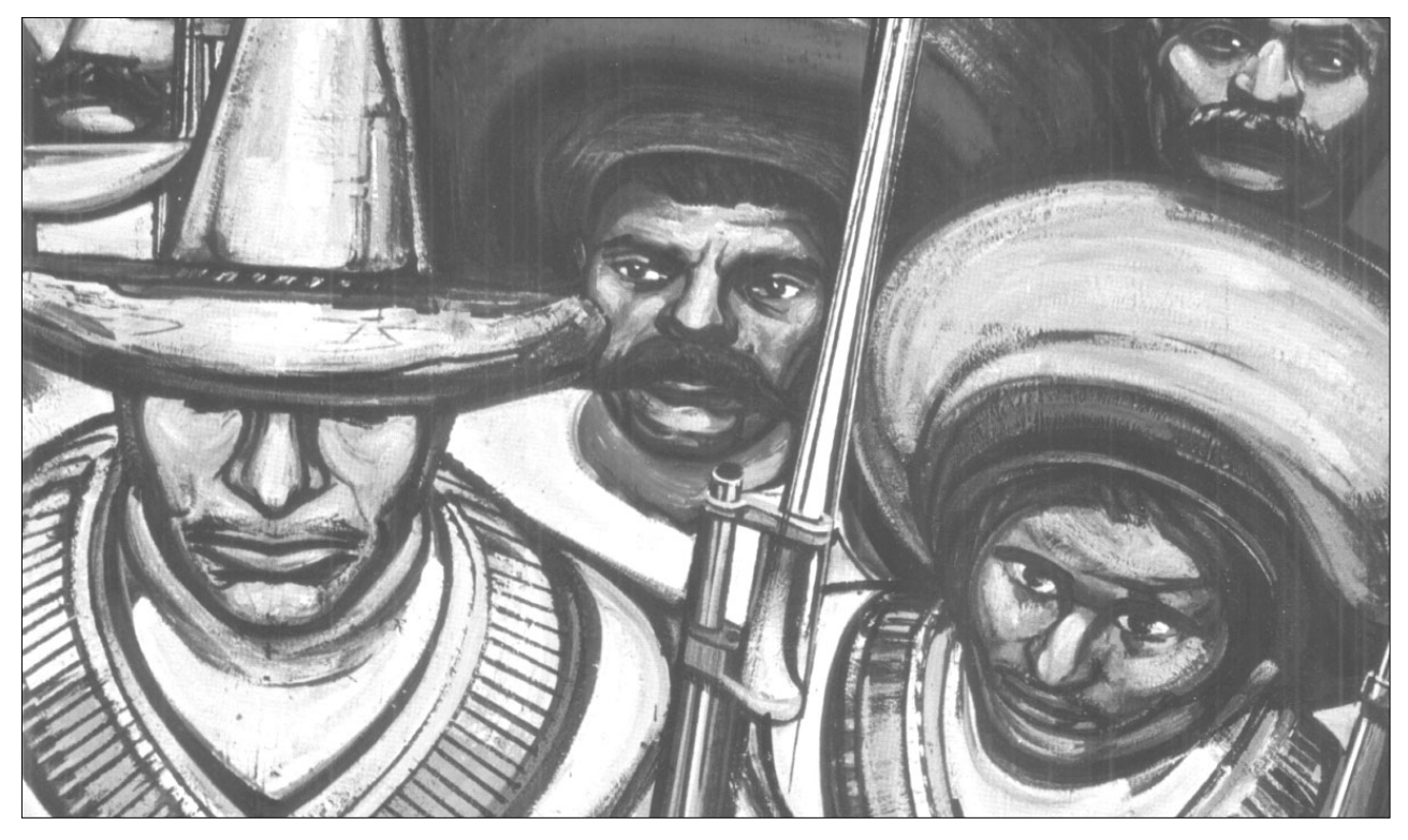
A stylised picture of "the Mexican revolution" — without class definition — by David Siqueiros, the Stalinist painter who tried to murder Trotsky