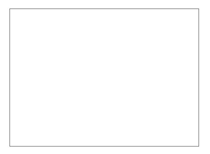
Labour Party conference

4. The original Labour Representation Committee of 1900, the first form of the Labour Party, had union affiliations totalling only 353,070 members, less than 20% of the total trade union membership at the time of 1,908,000. Only bit by bit did the affiliated membership rise to 1.45 million in 1909. If the socialists, and the more politicallyassertive unions, had waited until they had a majority, or near-majority, of the union movement, then the Labour Party would not have been founded at all in 1900 Likewise today: to wait for all the big unions to move would be to paralyse ourselves. We should fight for the socialists and the more politically-assertive unions to give a lead — and do so fully aware that, with recent industrial defeats, in the calculable future growth for a new working-class political venture is likely to be slower, not faster, than after 1900.