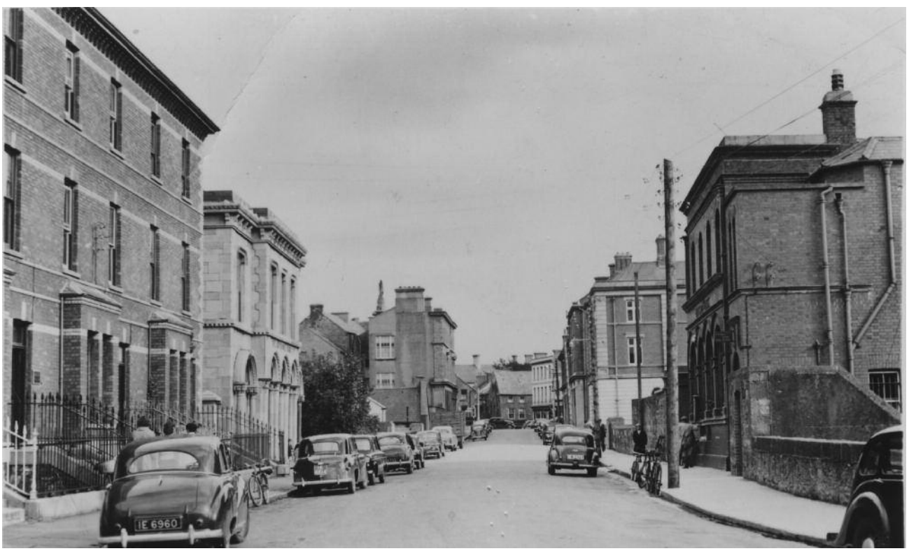
Posh street in Ennis, about 1950

But the fundamental weakness of the labour movement was the weakness of the Irish working class in the 26 Counties.