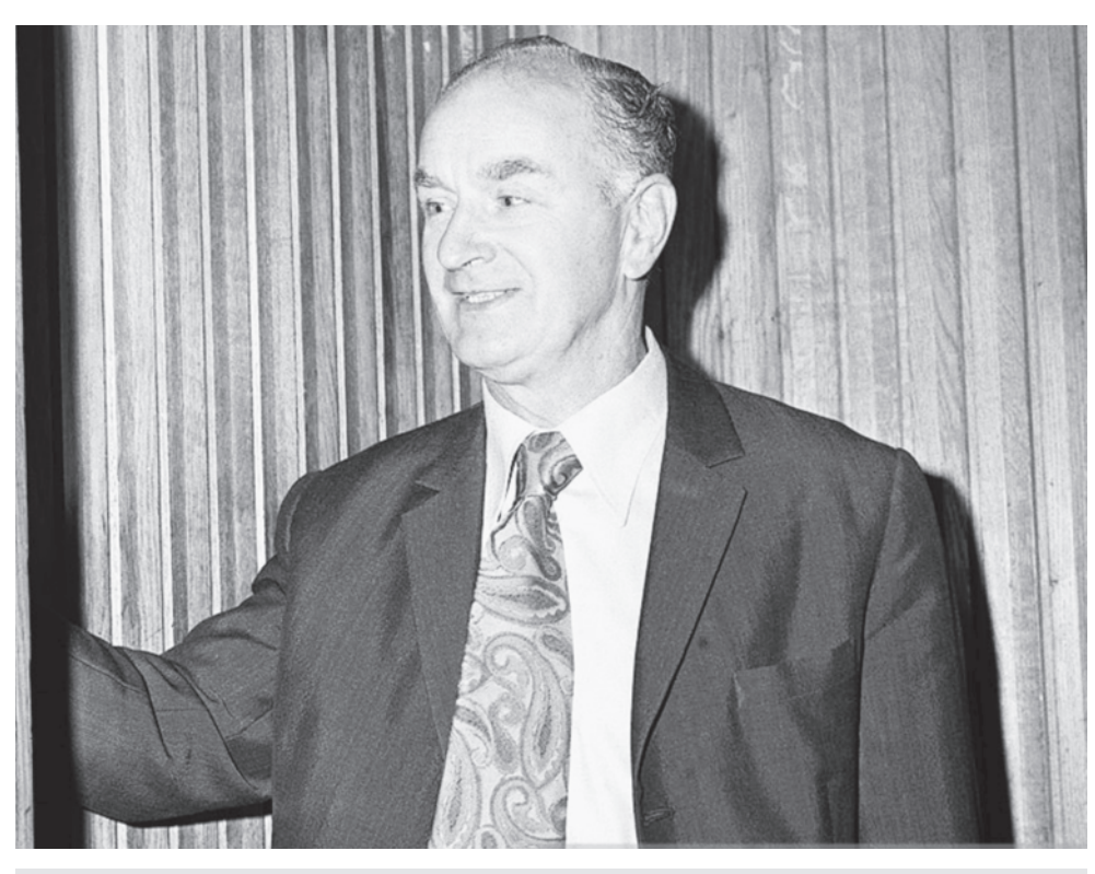
A shift in the unions — towards hostility to the EEC — was key. The election of former Communist Party member Hugh Scanlon as President of the engineers' union, AUEW, was part of that shift.

When the Tories unexpectedly got back into government after the general election on 18 June 1970, they immediately set about continuing the Wilson government's efforts. The Tory manifesto for that election was more cautious about Europe than Labour's, committing solely "to negotiate, no more, no less". In May 1971 Heath met with the French