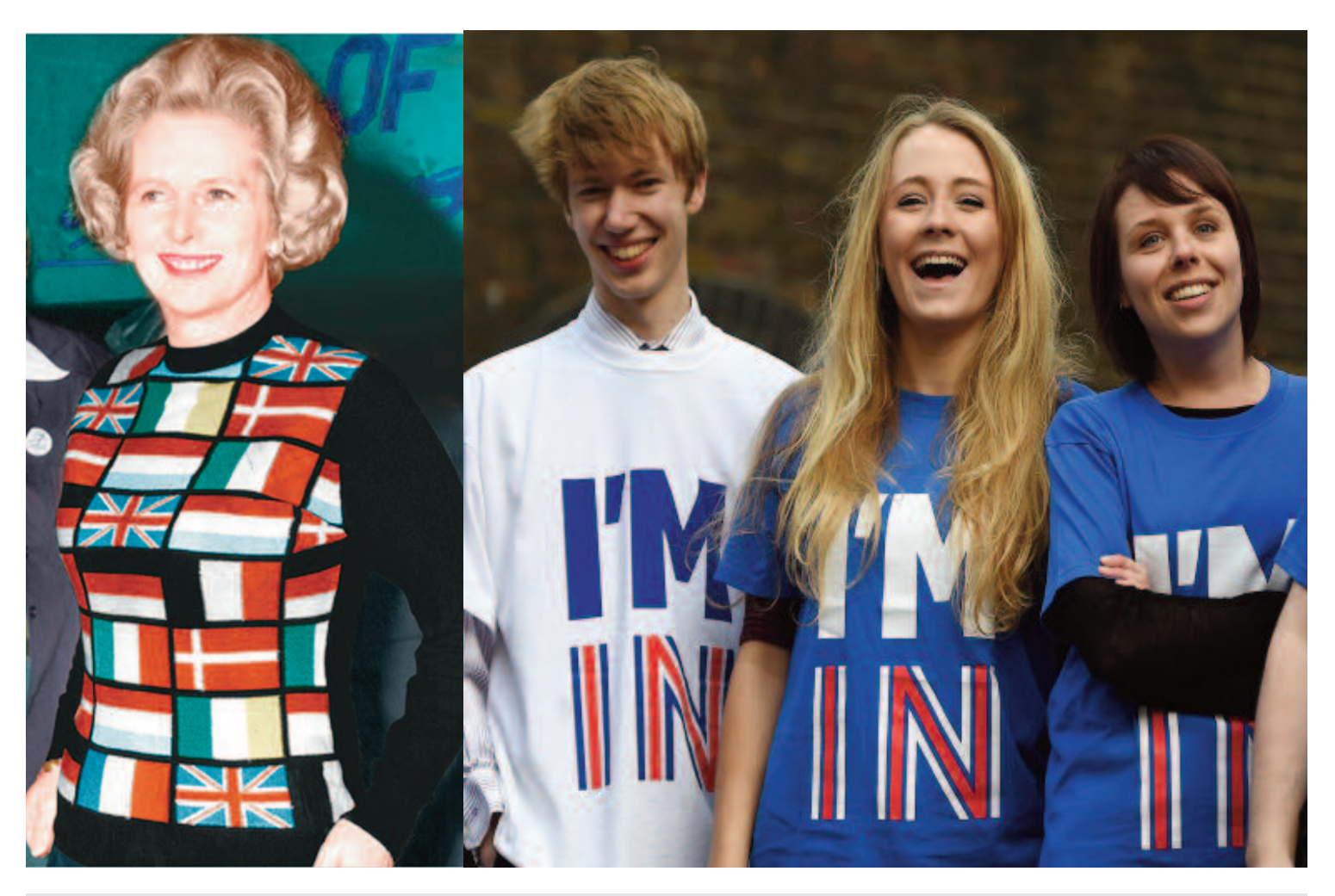
Mainstream "In" campaign in 1975 and in 2016

It had not reassessed on the EEC after two