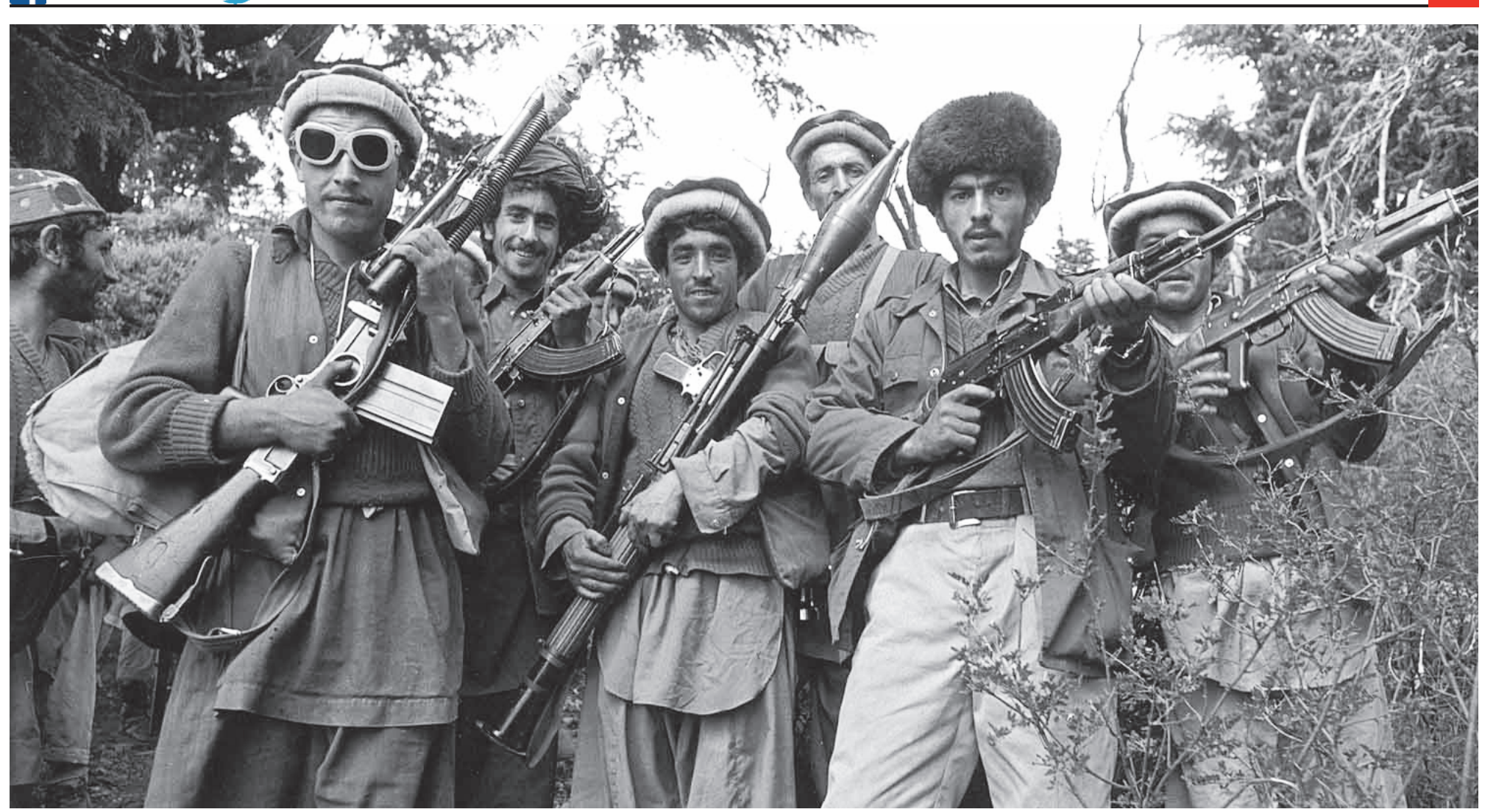
Afghan Muhajadeen who fought against the Russian invasion

independently for their immediate interests. Militant accepts that such workers' organisation is impossible under Stalinist rule. It deplores the fact, but accepts it as an inevitable feature of a whole stage of development in which the active agent, deserving of support for its progressive work, is the Stalinist bu-