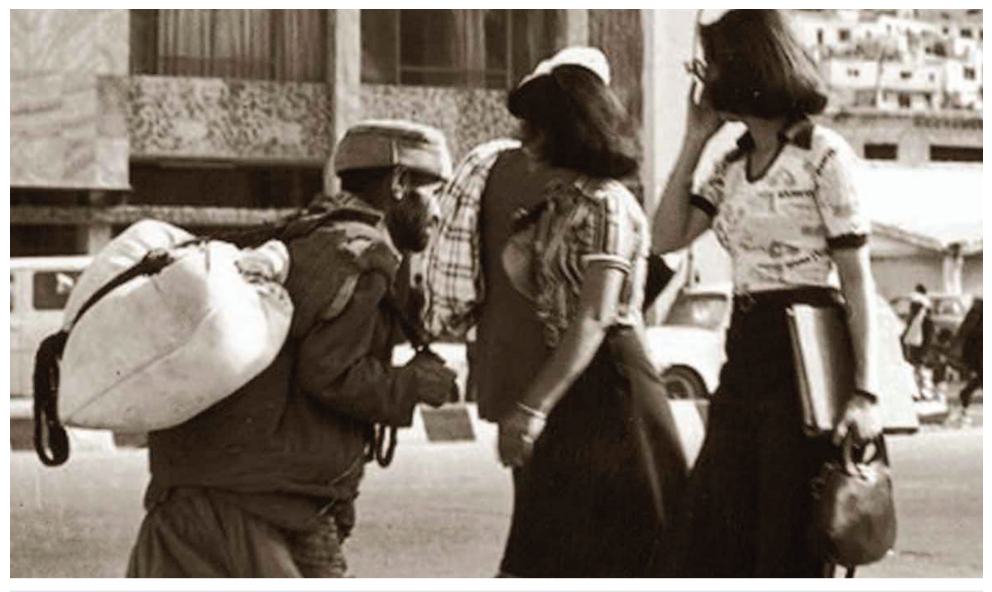
After the Russians withdrew, Afghan cities were still under attack from the mujahedin-controlled rural areas

reaucratic collectivist) disguised within the verbiage of Trotsky's theory, and placing a plus sign of appreciation against the new class society between capitalism and socialism, while Shachtman placed a minus sign, calling it barbarism,