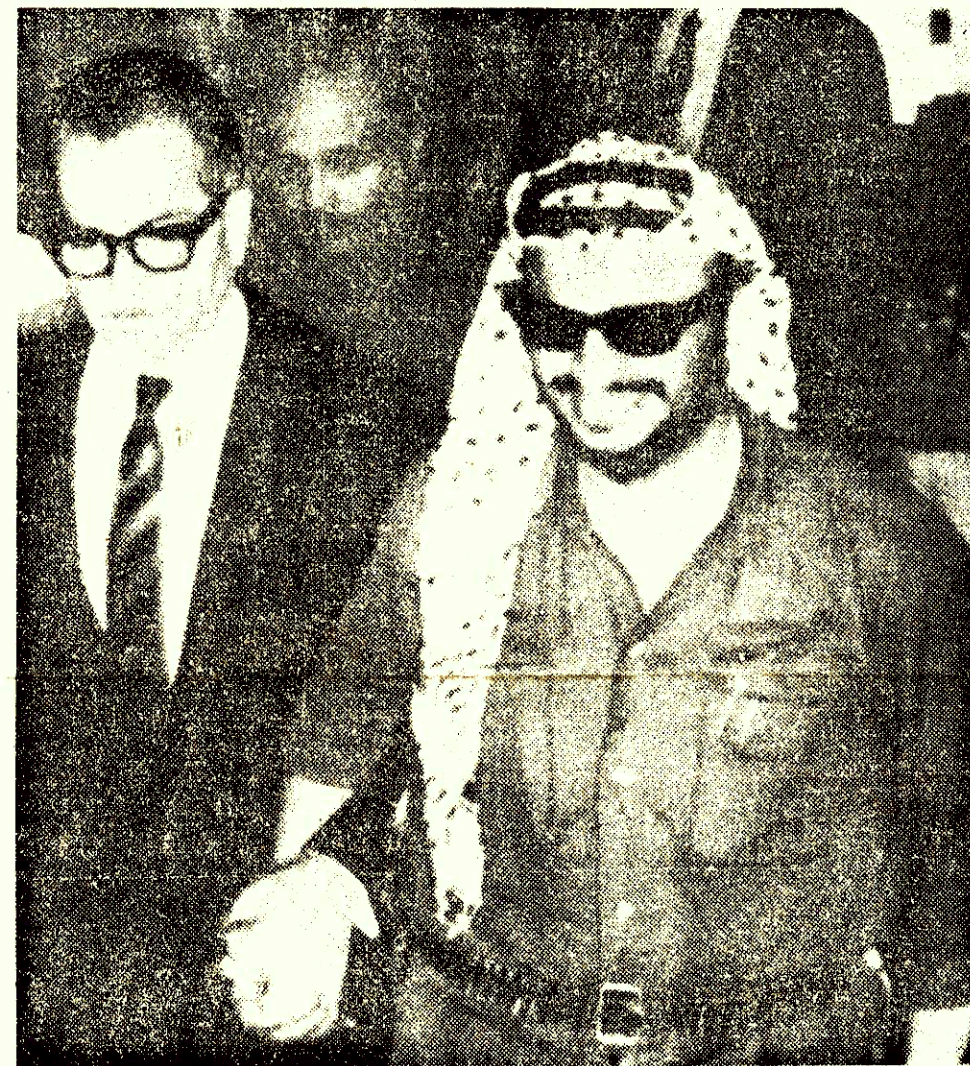
Al Fatah leader Yasser Arafat holding hands with Jordan Prime Minister Abdel Rifai (left) this week.