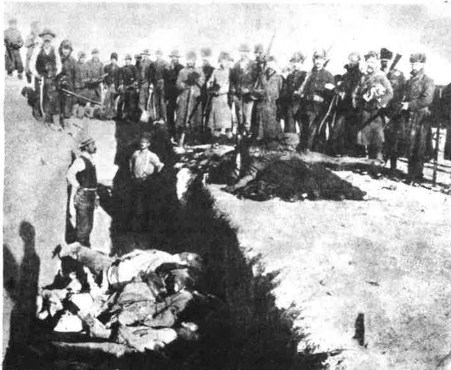
Bodies of Sioux people slaughtered at Wounded Knee were thrown by U.S. troops into a mass grave.

singled out by the U.S. colonialists for the most vengeful hatred. Originally, the Sioux, or Teton Dakotas, were not inhabitants of the plains, but of the forest, and lived in the lake region around the head of the Mississippi River. They were members of a confederation of tribes called Dakota, meaning allies or comrades, but were renamed "Sioux" by French traders who coined the term from the Algonquin word meaning "enemy." Of course, the real enemies were these traders, who, by the end of the 18th century, had driven the Dakota