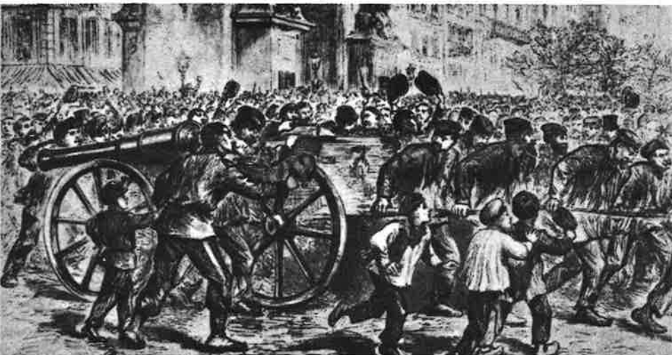
The revolutionary people of the Paris Commune protect their guns from the police and Thiers' soldiers.

All over the country, women of YAWF pledged themselves to fight for the rights of women as a crucial part of the class struggle. □