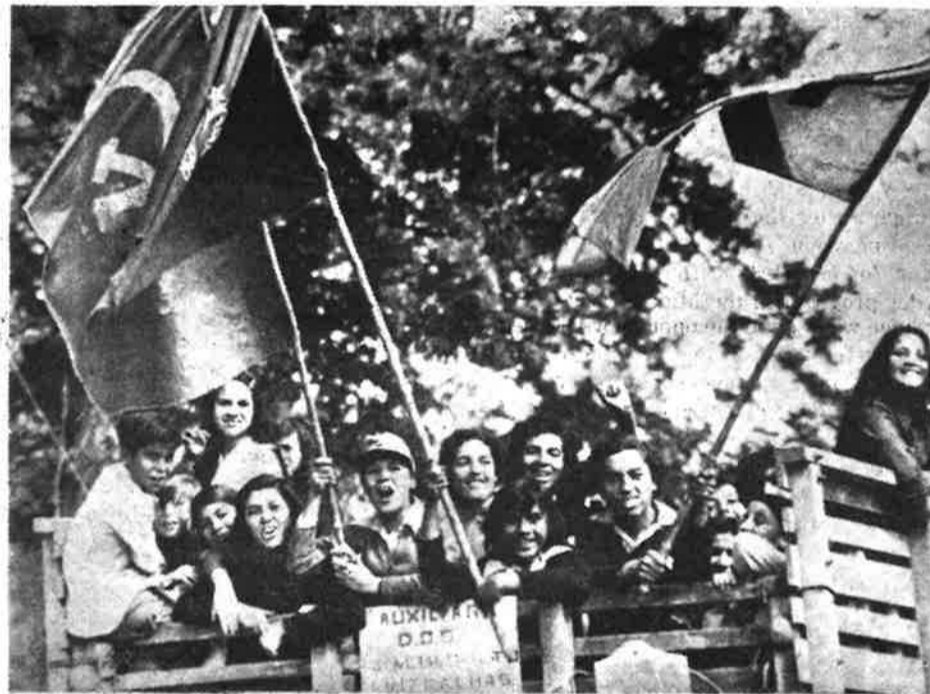
Leftist Chilean youth volunteer for farm work.

The two currencies have an established rate of exchange, for example, $1 for 4 German marks, $1 for 5 French francs, or $1 for 300 Japanese yen. At any given time, these exchange rates tend to fluctuate according to the supply and demand of dollars. Take West Germany for example. The supply and demand for dollars in Germany is a reflection of trade and investments between Germany and the U.S. Thus when Germans sell goods to the United States, or U.S. businessmen buy plants in Germany, Germans get dollars. And when Germans buy goods from the United States or make investments in the United States, they must pay in dollars.