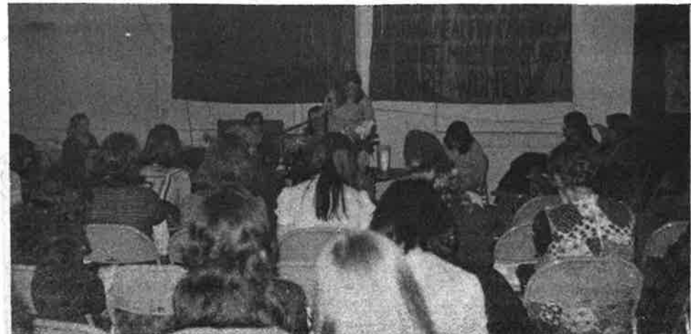
On March 9, New York YAWF Women celebrated International Women's Day with an open forum on women and marriage under the various social systems.

YAWF Women in Houston, Texas, showed the film "Salt of the Earth." This moving film tells the true story of a mining strike in the Southwest that was fought and