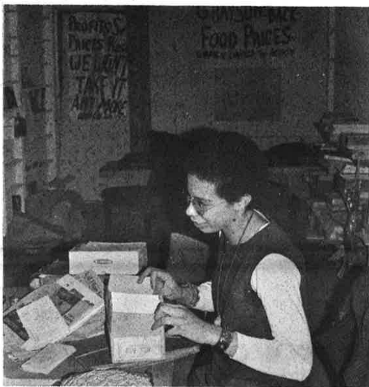
Getting out the work at the office of Women United for Action, 58 West 25 Street, New York, N.Y. (212-989-1252).