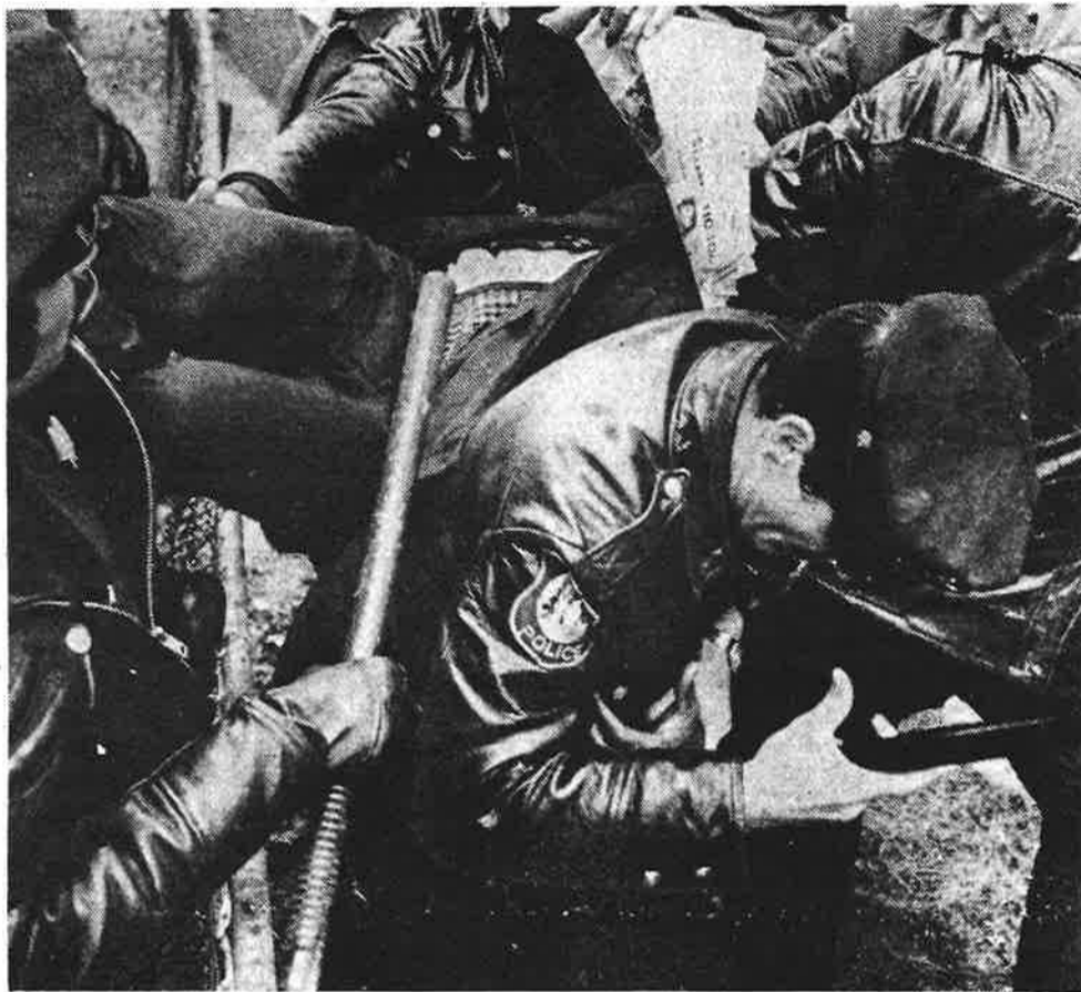
Cops drag away representative of Kawaida Towers. Can you imagine a white real estate agent being treated this way?

fundamental struggle against racism. Like the struggle around the housing project in Forest Hills, N.Y., the lines have been clearly drawn between white racists, who want to prevent Black and Latin people from living in white neighborhoods, and the oppressed people's demand that they be able to get decent housing in any area they choose to live.