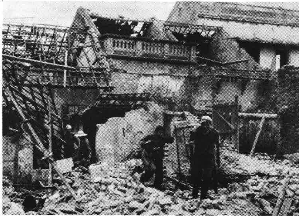
Buildings in North Vietnam devastated by U.S. bombs.

So much for his self-proclaimed sympathy for the victims of Wall Street's aggression. He only regrets that the U.S. can no longer "police the world alone." Other phony liberal politicians, who only a few weeks ago were beating their breasts in sorrow for the Vietnamese while asking for