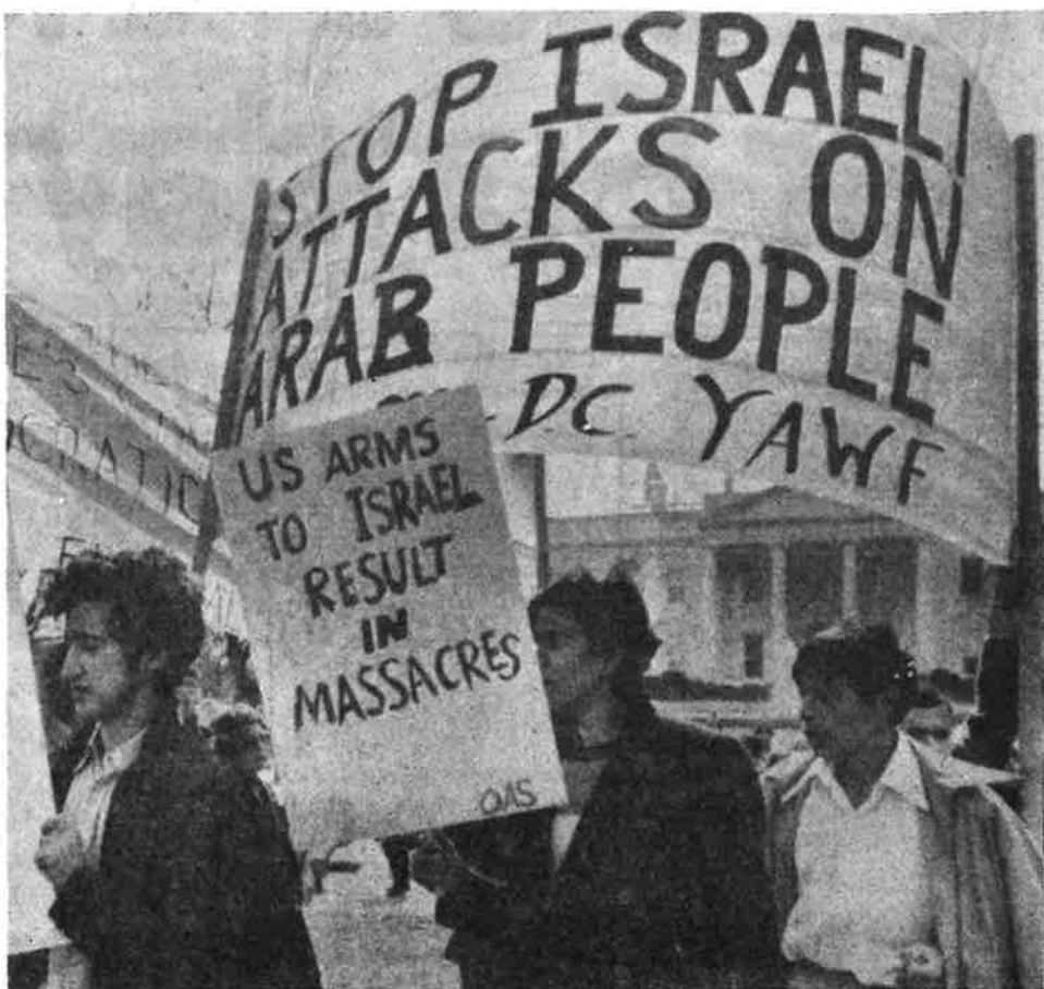
Demonstration in Washington against Nixon-Meir meeting.

During the last few years, Libya and Iraq have set an example for the other oil-producing countries by successfully demanding large increases in the royalties paid them by the companies and, in the case of Algeria, by assuming 51 percent ownership of its oil resources. Their example was quickly followed by others,