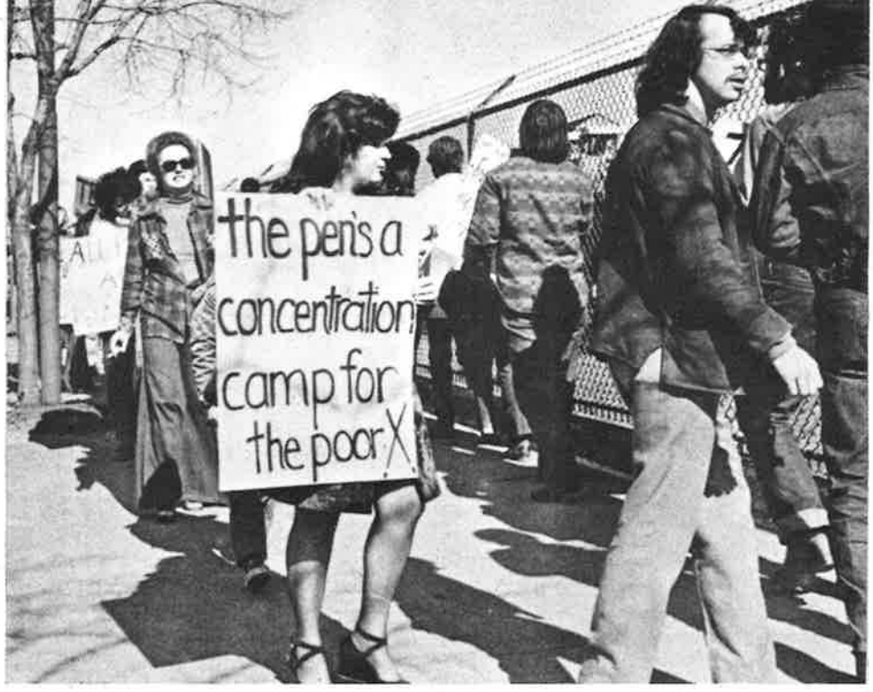
Prisoners' relatives join Prisoners Solidarity Committee in demonstration at Virginia State Penitentiary.

The County Board is still refusing to let the community conduct the investigation, but that won't stop the PSC's determination to inform the people of this city about what is really going on in the House of Correction and to give relatives and ex-inmates a chance to conduct a real investigation of the jail.