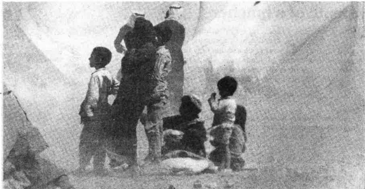
Hundreds of thousands of Palestinians who fled from Zionist terrorism still live in refugee camps like this one and dream of returning to a liberated homeland.

It is the furthest thing from anti-Semitism to say that the only hope for the peace and survival of the Jewish people is a total rejection of Zionist policies. The only solution is friendship and alliance with their Arab neighbors, the repatriation of the Palestinians; and a socialist revolution that will at last free the Jewish people from the death trap the Zionists have built.