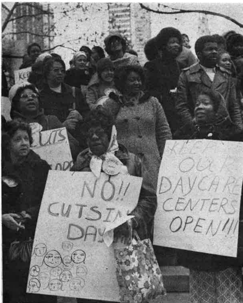
Day care parents and workers protest in New York's Bryant Park against the further cuts in social services that threaten to close many child-care centers.

worried about where they will find these billions owed to city workers. Oh no. They are scurrying around trying to invent new ways to make the workers cough up enough money to pay the banks! These immensely rich financial in-