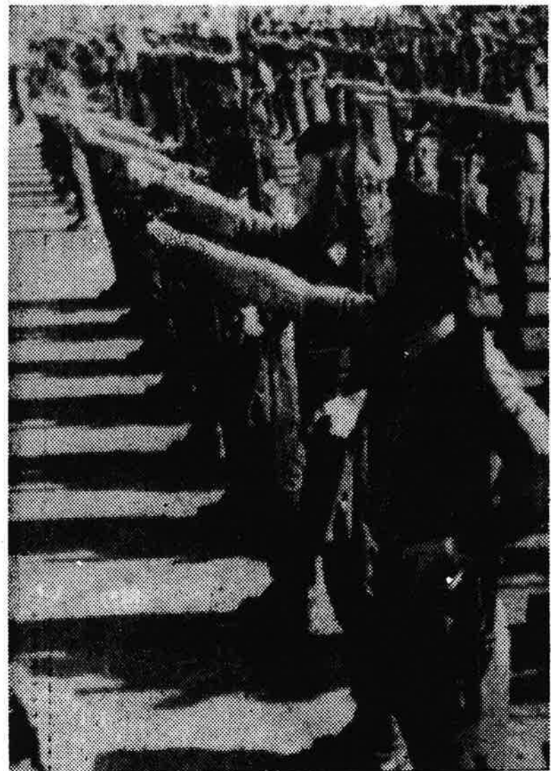
Rank-and-file Portuguese soldiers take oath last Friday: "We swear to struggle with all our capacities . . . against fascism and against imperialism, for democracy and Power for the People, for the victory of the Socialist Revolution." Oath was administered by a member of the Workers' Commissions.

And Friday, 670 soldier-recruits at an artillery regiment gave the oaths to the flag with clenched fists outstretched: "We, soldiers, swear to be loyal to the country and to struggle for liberty and independence. We swear to be always, always on the side of the people, in the service of the working class, the peasants and the laborers. We swear to struggle with all our capacities, with voluntary acceptance of revolutionary discipline, against fascism and against imperialism, for democracy and Power for the People, for the victory of the Socialist Revolution."