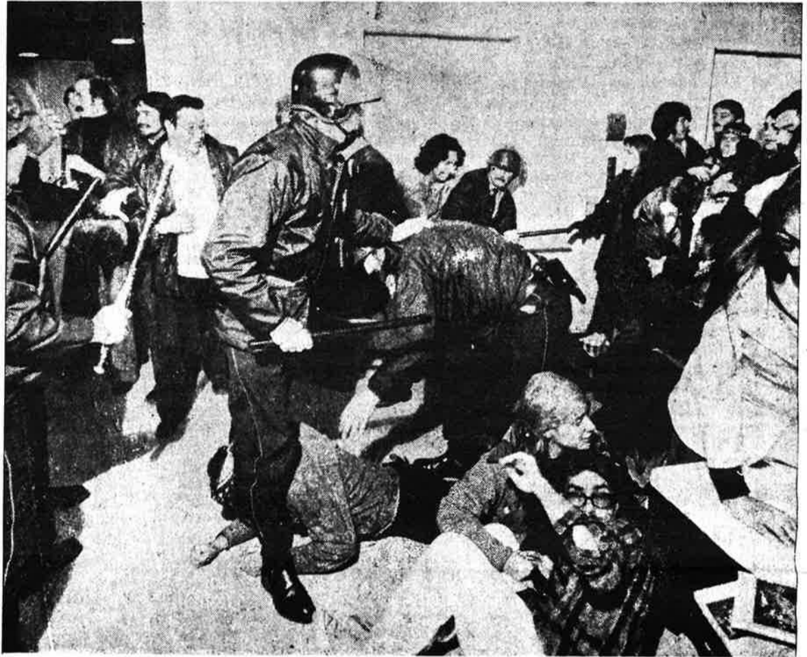
Helmeted, club-swinging cops charge into peaceful demonstrators sitting down at Milwaukee's War Memorial, injuring and arresting many. The demonstrators were protesting the speech to the John Birch Society of an FBI informant known to have infiltrated AIM during Wounded Knee.

The fact that at least one police officer also required hospitalization last night demonstrates that Native Americans and all other oppressed poor people will not be intimidated and will fight back.