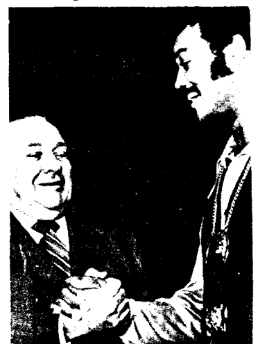
Soul Shake: Chicago's Mayor Daley and Jesse Jackson.

The Panthers' serious internal difficulties, manifested not only in the present decisive split but also in the endless series of expulsions, reflects the impossibility of building a revolutionary organization with street gang methods. Because the Panthers recruited adventurous youth without a stable axis, they could only prevent the disintegration of their organization into competing warlordisms through the imposition of a kind of military terror. New recruits were assigned fifty push-ups for failing to memorize the Panther program, and pressure was put on them to do two hours of reading a day. It is argued that such coerced internal political life is necessary in any radical organization not composed primarily of middle-class intellectuals. But the history of the proletarian socialist movement in the U.S. and elsewhere yields many examples of organizations in which articulate and politically able industrial workers though often lacking formal education, shaped policy, and did not merely memorize a program by rote, like a prayer. This was possible because the socialist movement recruited workers to a comprehensive program for long-term political goals. The Panthers, on the contrary,