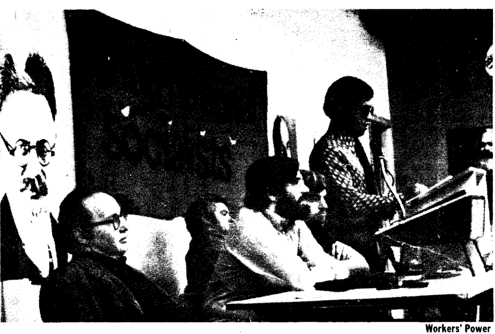
IS "rank and file" conference: collecting trade unionists on a lowest-common-denominator level.

is brought to the working class from without by conscious communists. It is no accident that What Is to Be Done? links the devastating criticism of the Economists with an assertion of the need to build an organization of professional revolutionaries, a vanguard party. The party is the concrete embodiment of communist consciousness; without it, there can be no talk of successful revolution. As Gramsci noted: "The decisive element in every situation is the force, permanently organised and pre-ordered over a long period, which can be advanced when one judges that the situation is fathe ISC. vourable (and it is favourable only to