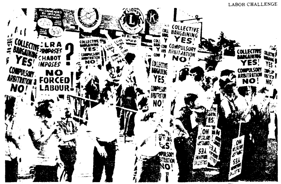
B.C. workers demonstrate against Socred anti-labor laws in 1972.

LRB decisions were to have the force of court orders—unions found in violation of one of its provisions would be subject to $1,000-a-day fines, indiv-