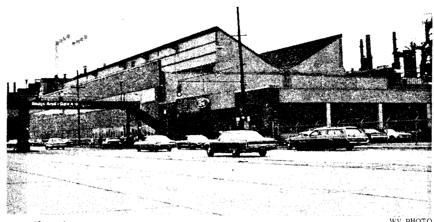
Ford's River Rouge complex in Detroit.

By far the most grovelling performance, however, has been by supporters of the Progressive Labor Party. With originally only one committee member sympathetic to their politics, himself a member of the motley hodgepodge called United Trade Unionists (UTU), ever increasing numbers of PL supporters simply started attending