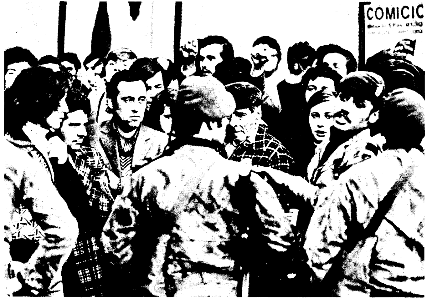
Troops confront demonstrators in Lisbon last year.

FEBRUARY 20-After a period of relative calm following the September 29 "stabilization" in the face of a threatened right-wing coup, events in Portugal are once more rising to a crisis level. Deep dissension exists within the Movement of the Armed Forces (MFA) over questions of political and economic policy, and open strife has broken out within the government between the Portuguese Communist Party (PCP) and the Socialist Party (PSP). Meanwhile the reactionaries connected with the previous Salazar-Caetanodictatorship are moblizing and have formed an ultra-rightist party, the Social Democratic Center (CDS), officially launched last month and already granted legal