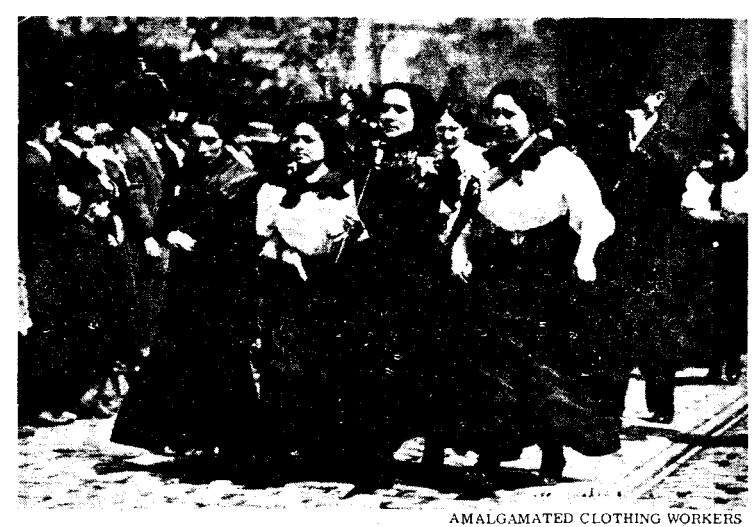
Garment workers during 1919 strike.