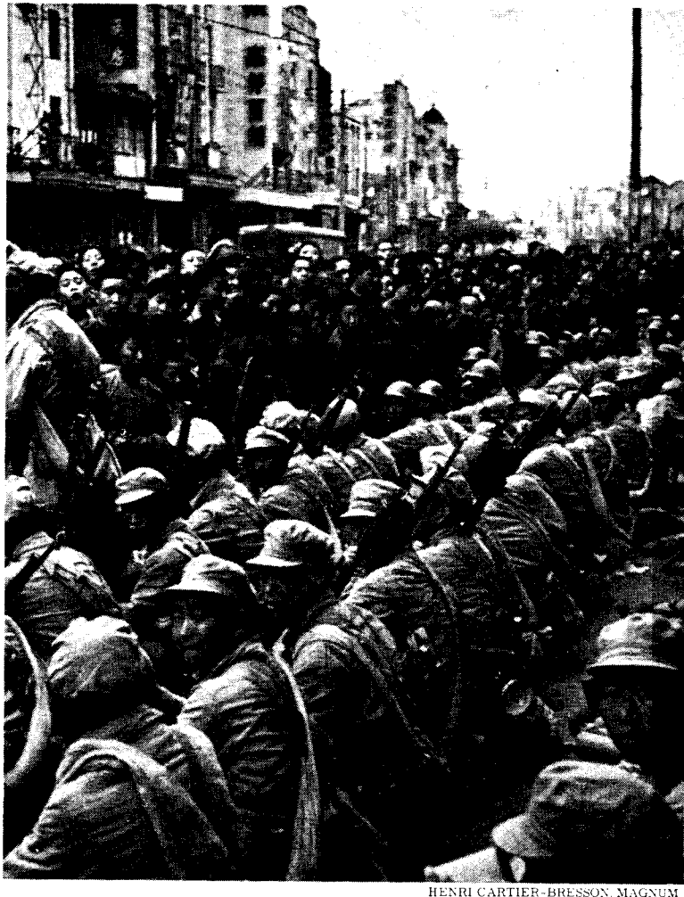
Mao's troops entering Nanking in April 1949. Shortly afterward Stalinists raided local organizations of Chinese Trotskyist Party, arresting scores and secretly