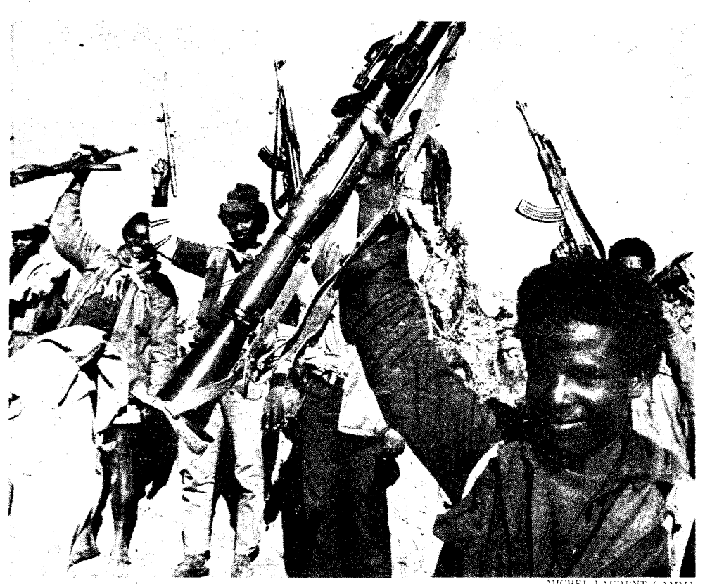
Eritrean Liberation Front fighters in January.