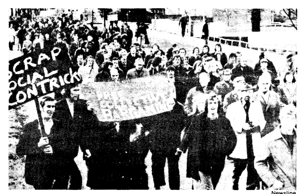
Auto workers at British Leyland plant in Birmingham demonstrate against the "social contract" last month.

While Evans has continued to back the Social Contract, the other contenders are trying to distance themselves from a policy of continued wage restraint in the wake of the factory-floor revolt. Three bureaucrats are particular-