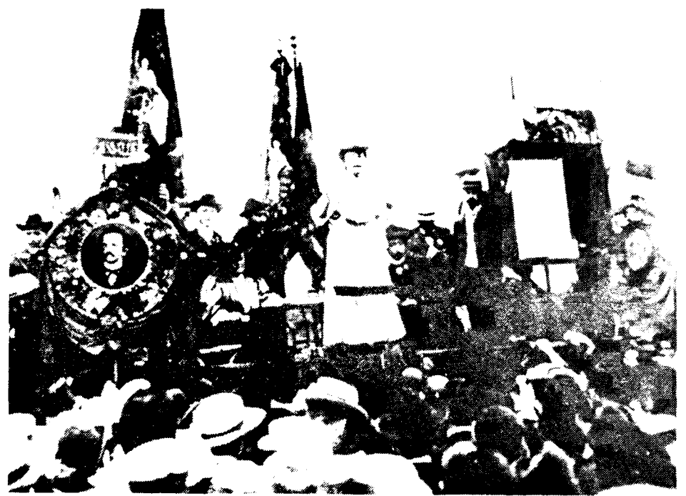
Rosa Luxemburg flanked by portraits of Marx and Lassalle speaking at SPD meeting in 1907.