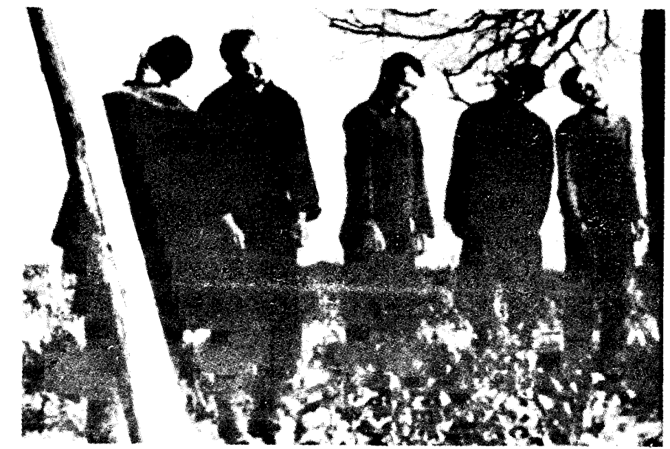
Ukrainians greeted invading Nazi army in 1941. Nazis began by killing Communists, Jews, Russians and finally the Ukrainians themselves. This is the sort of "democracy" imperialists are calling for.