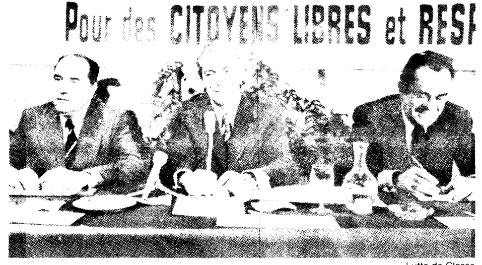
Lutte de Classe

Of course, it notes, it is not possible for "a city [to] be transformed into an 'island of socialism'...." Beginning from