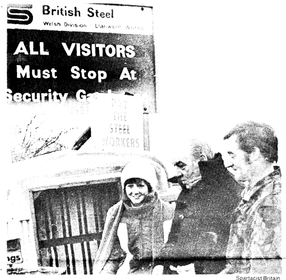
Llanwern, South Wales, steelworker pickets: Thatcher government wants to eliminate two-thirds of the jobs.

While the ISTC and NUB leaders seek to limit the strike to the single issue of higher pay, there are growing demands in the ranks that the fight must also be against the massive redundan-