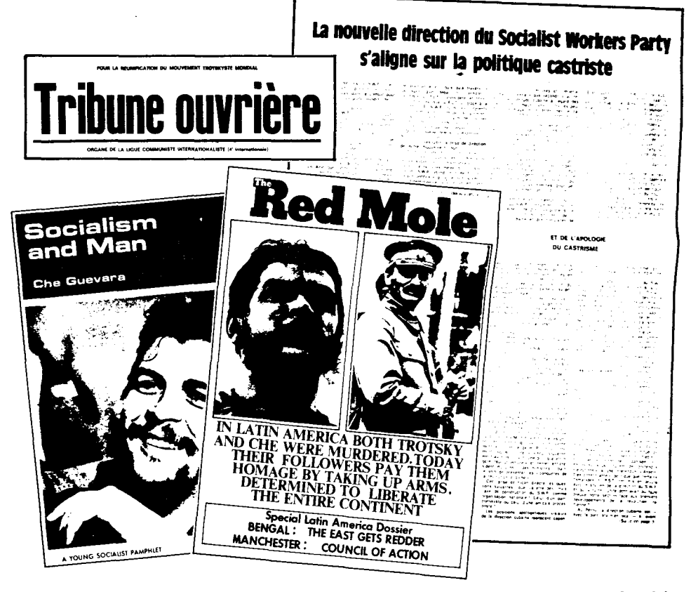
Parity Committee supporters attack SWP's "new" Castroite leadership (top), but as IMG's Red Mole and SWP pamphlet show, USec Castroism wasn't born yesterday.

"13. The Cuban Revolution has exposed the vast inroads of revisionism