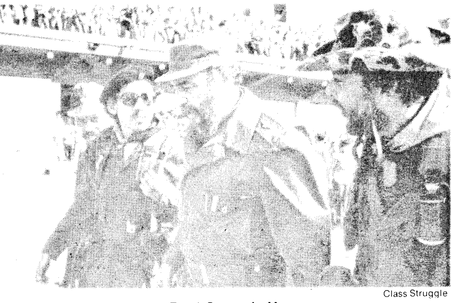
Sandinista commanders with Fidel Castro in Havana.

Simón Bolívar Brigade (BSB) as a publicity apparatus to make a name for the BF and as a pressure group to push the FSLN to the left. But soon after the U.S. puppet dictator fled in late July, the Morenoite-led BSB got into hot water with the Sandinista tops. After little more than a week of organizing unions and urging local militias to hold onto their arms, the Brigade got the ax from the new junta. On August 17 the BSB was rounded up and herded onto planes for Panama, where several of the brigaders were beaten by the National Guard. That might have been the end of the episode, except that SWP and Mandelite representatives in Managua publicly endorsed the deportations. Moreno may have lost his chance for a big-time operation in Nicaragua, but he got his pretext to split the USec. In a