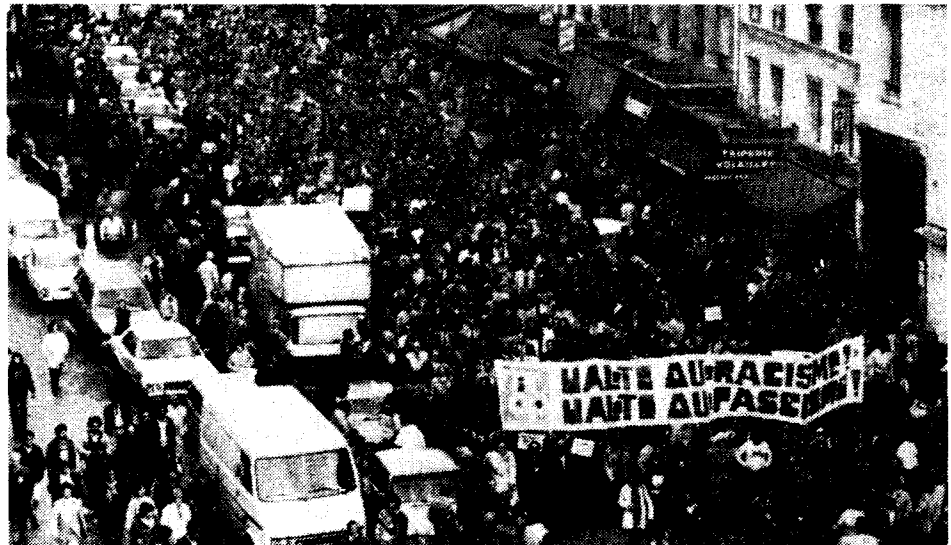
Paris, 7 October: 200,000 march in outrage over fascist atrocity.

Both the fascists of the European National Fascists (FNE), which is generally held responsible for the Paris synagogue bombing, and the police "unions" claim that 30 of the FNE's reported 150 members are highly-placed police officers, in particular in the Renseignement Général, a sort of