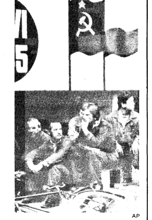
Polish workers: Don't need to discuss much, Gus?

At root is the contradiction inherent in all the Stalinist deformed and