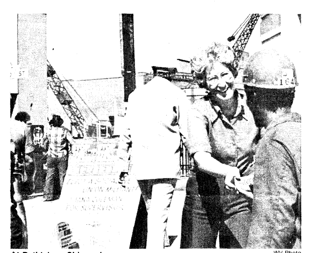
At Bethlehem Shipyards.

"The silent 'progressive' incumbents you support were not the ones who stopped the Nazi/Klan scum from celebrating Hitler's birthday in our labor town—it was the April