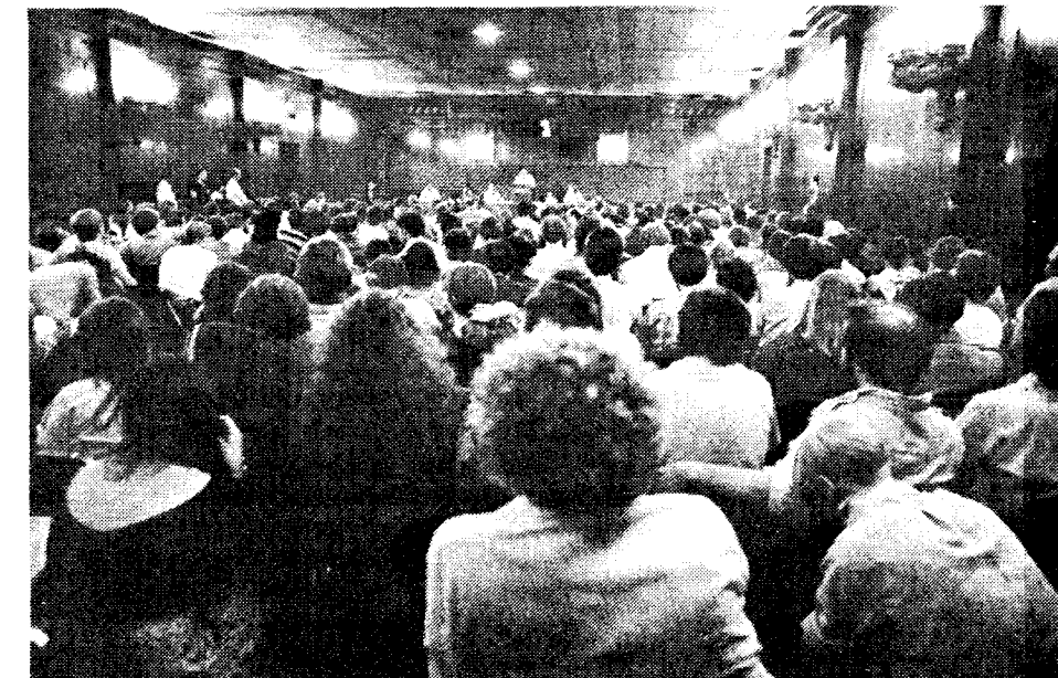
Participation of international comrades showed increased weight of other sections of Spartacist tendency.

The conference discussion stressed that the present period is not the stultifying 1950s, but a contradictory situation which can present fruitful opportunities for revolutionary intervention. The prevalent mood is not the "silent majority" complacency of the 1950s but one of frustration and