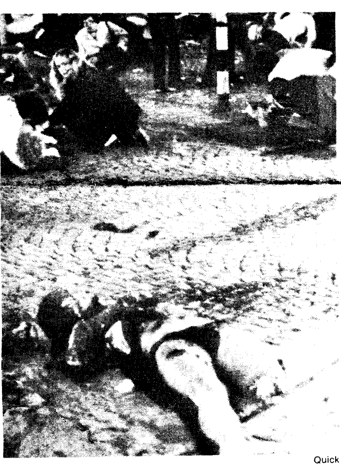
Munich: Oktoberfest bombing

Paris reverberated in horror at the temple bombing, the most dramatic attack on Jews in Europe since World War II. "Monstrous" and "Assassins" ran furious banner headlines in the bourgeois papers, and the outraged population of France poured out into the streets in protest. The blast immediately riveted attention back to those nightmare years of Vichy France when 75,000 French Jews were exterminated—indeed, the Nazis had blown up the same synagogue, the "Israelite Union," in 1944. But even as they were leading the protest demonstrations, the reformist misleaders of the French workers movement were once again seeking to answer the fascist threat, not with mass mobilizations to smash the fascists, but with a big show of "national unity." The led to the present situati