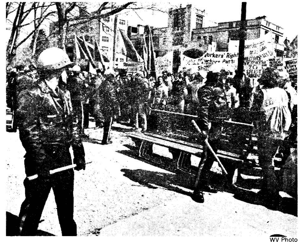
Washington, D.C., March 27: Awesome display of police power used to seal off the left.

This, then, is the context in which the Somoza family dictatorship was overthrown in Nicaragua by a pettybourgeois guerrilla army backed by mass support and supported (at least initially) by those remaining sectors of the bourgeoisie who had not vet been consumed by the Somoza family. In El Salvador a bloody and more classic civil war rages pitting the mass murderers and mercenaries of the local oligarchy (increasingly backed directly by U.S. imperialism) against a coalition of five autonomous guerrilla forces-less wholeheartedly embracing the middle classes but surely rooted amongst the largely landless peasants for whom the slogan "Revolution or Death" is for many a statement of simple fact-lately united around a program of seeking negotiated settlement. The Reagan administration, and notably key policy maker General Alexander Haig, the Secretary of State, sees the whole thing as a Communist plot with control of the leftist insurgents going back to Moscow by way of Managua and Havana while supposedly the guns flow the other way. Meanwhile a more rational, i.e., "liberal," wing of the bourgeoisie wants "no more Vietnams." They even can recognize that just because the Soviet Union is the main obstacle to making the world safe for capitalism, that doesn't necessarily mean that Iranian hostility to the U.S., British problems with Argentina and in Ulster, Israel's curious difficulties with even her most reactionary Arab leaders, are all part of a commie plot.