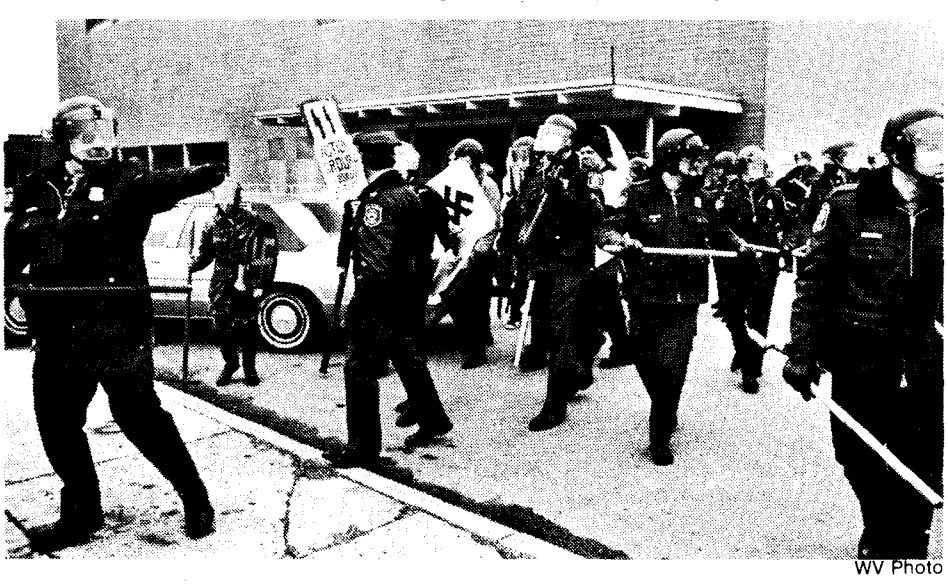
Ann Arbor, March 20: Cops rush in to protect Nazis from mass outrage.

sional anti-Spartacists who inhabit the area. At each point the Revolutionary Workers League (RWL) and Revolutionary Socialist League (RSL) have taken their cue from the liberals' hatred of the revolutionaries. The RWL-RSL "Coalition" wanted to "protest," not stop the Nazis because they thought that militant slogan would "alienate people." When the SL-initiated Committee was being violence-baited, they joined in. Never did they on their own seek to mobilize anyone, except a handful of cam-