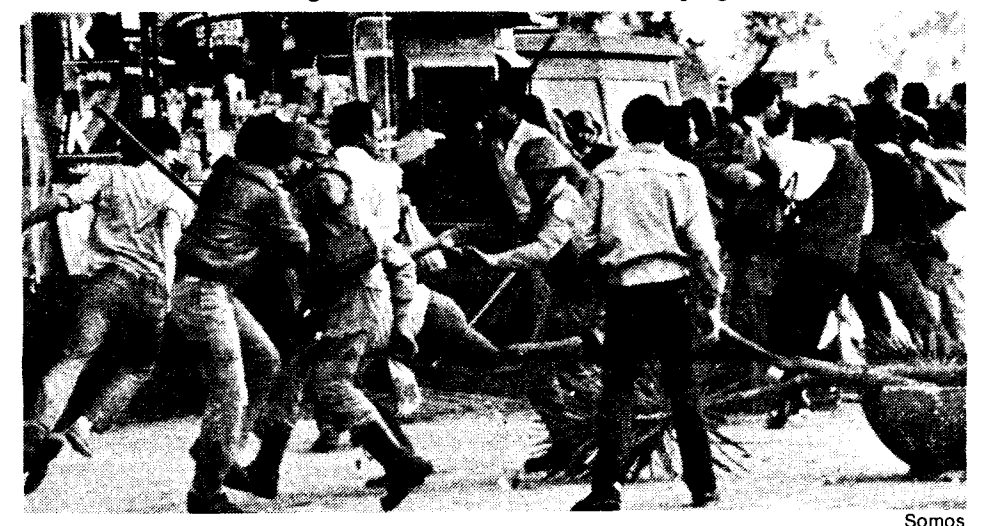
Buenos Aires, March 30: Bloody junta represses mass labor protests at home, then whips up a "national unity" diversion over Malvinas.

For the Argentinian junta under General Galtieri the Falklands invasion is a vital focus of national unity in the face of developing internal unrest over