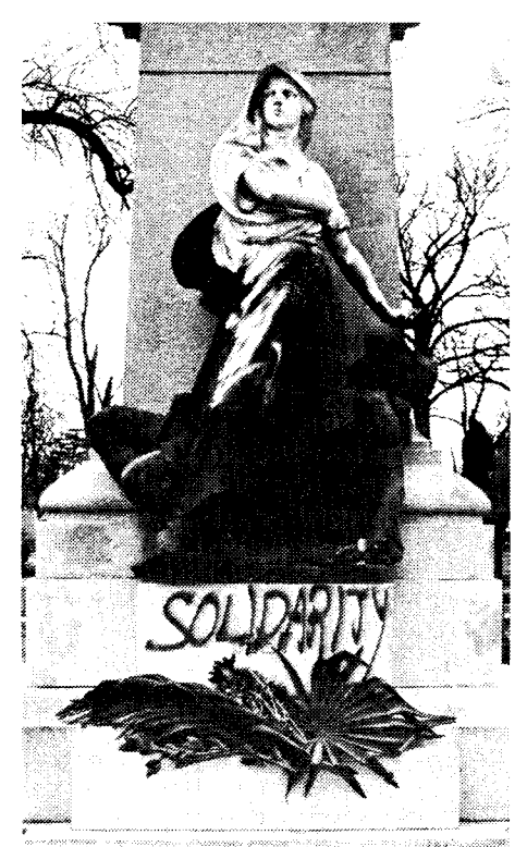
THE DAY WILL COME WHEN OUR SILENCE WILL BE MUNE POWETH US THAN THE VOIDES YOU ARE THROTTON'T TO DAY.

Supporters of Polish Solidarność chose to demonstrate their "Solidarity" by defacing this monument in December. In a vile anti-working-class exhibition white paint was poured over the head of the bronze statue marking the graves of labors' martyrs and "Solidarity" was spray-painted across the granite base in red. The link between the robber baron murderers of the Haymarket martyrs and the supporters of Poland's CIA-backed company "union" could not be more vividly portrayed. This act is in keeping with Solidarność' worship of Polish dictator Pilsudski, its appeal for membership in the imperialist bankers' International Monetary Fund, its praise for union-busting Reagan's America. Their brothers in Solidarność flee the "tyranny" of Poland for the