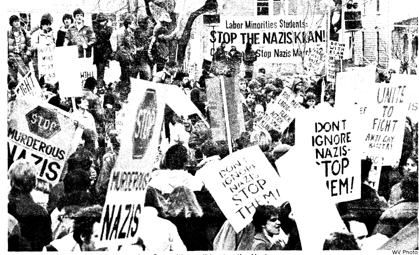
Ann Arbor, March 20: 2,000 respond to Committee call to stop the Nazis.

The local bourgeois establishment in Ann Arbor is in a state of vindictive frenzy because the mayor's diversionary "ignore the Nazis" rally on March 20 fell flat on its face. So now they are wailing continued on page 11