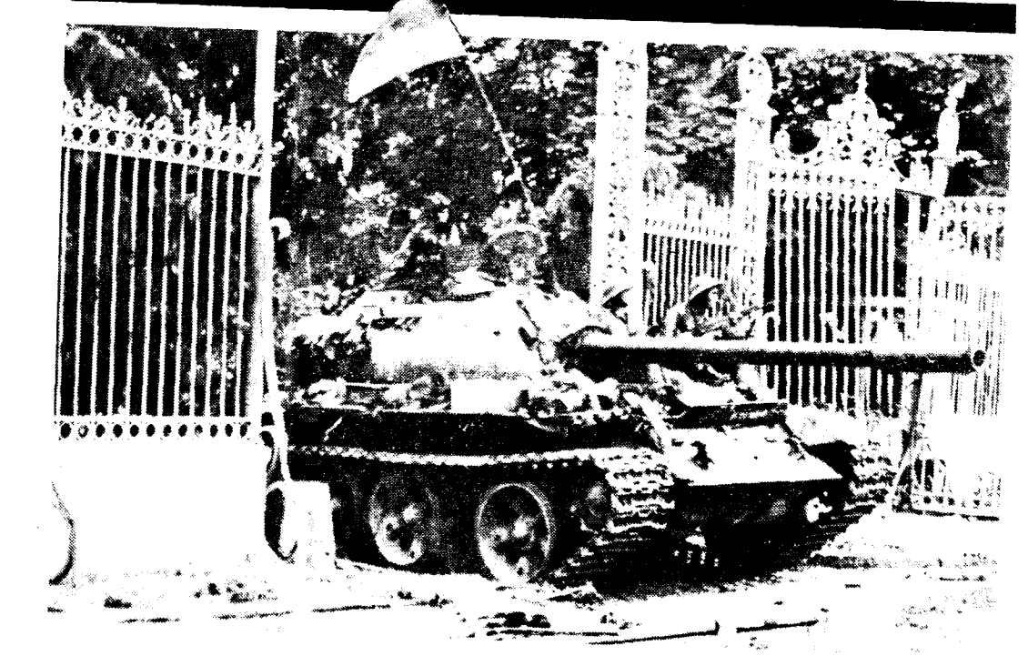
Vietnam News Agency