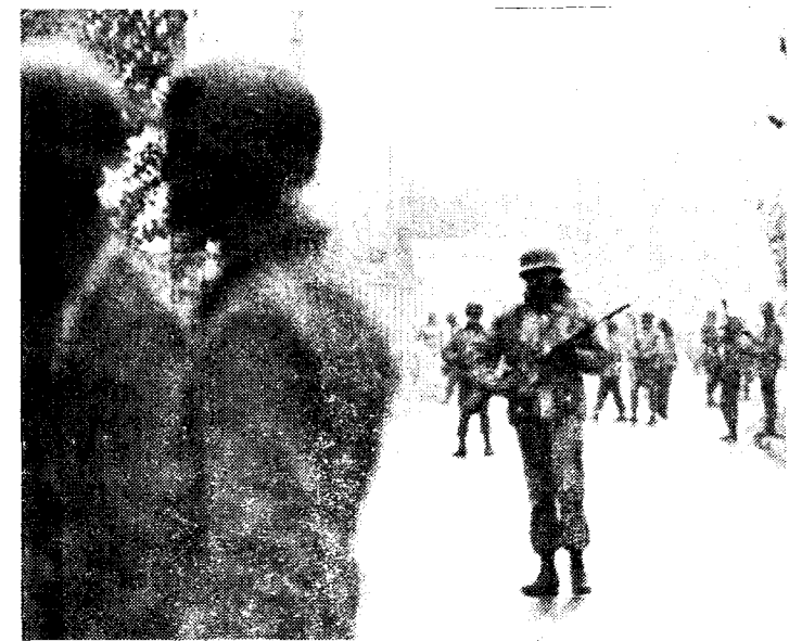
El Teniente miners (left) vote for a general strike. Chilean soldiers (right) comb through working-class barrios May 14.

1930s (in France, Spain and Chile notably), this class-collaborationist bloc paved the way to disaster by subordinating the workers to "democratic" bourgeois politicians like Christian Democrat Frei and "constitutionalist" officers like Pinochet. The UP literally disarmed the Chilean masses militarily and politically, preventing any serious resistance to the coup. The 1973 defeat was severe, but not a holocaust as in China 1927 or Germany 1933, after which the proletariat did not raise its head for a generation. As a Spartacist League/ U.S. Political Bureau meeting stated a few months after the coup: