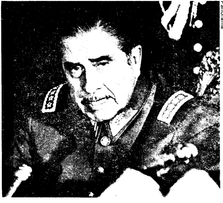
iNi olvido, ni perdón, Pinochet al paredón! (Neither forgive nor forget, Pinochet to the wall!)

Behind the explosion of opposition to the Pinochet regime is a depression rivaling that of the 1930s. But while it is fed by the worldwide capitalist crisis, the policies of the Chilean dictatorship have turned this into a catastrophe. The "economic miracle" of the "Chicago boys," disciples of monetarist madman Milton Friedman, have devastated Chile. Last year, according to official figures, the country's gross national production plunged by 14 percent, compared to a 1 percent decline in South America as a whole. According to government statistics, 30 percent of the workforce is jobless and another 5 percent are working on government starvation wage ($27 a month) projects. In a continued on page 8