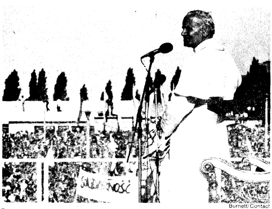
Pope stirs the spirit of clerical counterrevolution in Nowa Huta—town of the Stakhanovite "Man of Marble," now a Solidarność stronghold.

be a matter of indifference to the nations of the world, especially Europe and America" (Warsaw).