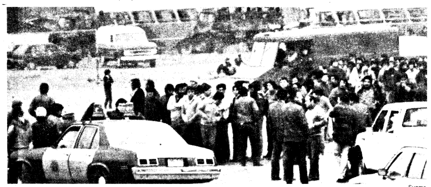
Santiago, May 14—Shaky Pinochet regime responds to May mobilizations with mass arrests, torture, killing.

people joined the funeral procession shouting anti-government slogans. Then in the early morning hours of May 14 the military struck hard. At 4 a.m. dozens of army trucks carrying heavily armed combat troops pulled up to the La Victoria and João Goulart shantytowns. Streets were cordoned off as loudspeakers ordered all males over the age of 14 to come out. Some 3,000 men were picked out and hauled off to the soccer stadiums where they stood for hours in the rain for "identity checks." Several hundred were then removed to