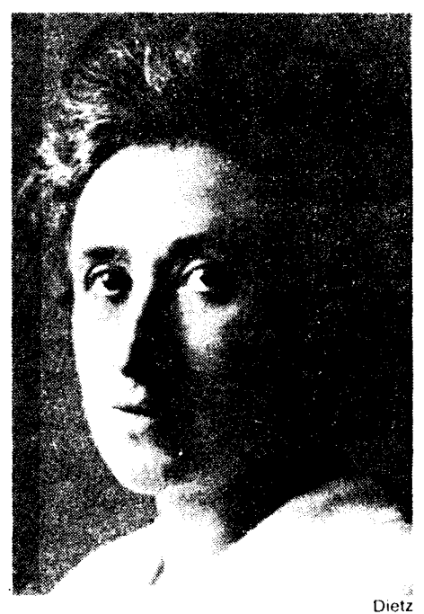
Rosa Luxemburg, Communist leader and martyr, epitomized the internationalist tradition of Poland's historically socialist proletariat.

Wojtyla's anti-Communist pilgrimage and the reported deal to establish a church-run "union" in Poland demonstrate anew that the Stalinist bureaucracy acts as a transmission belt for the imperialist pressures on the Soviet bloc. There can be no "peaceful coexistence" with the Vatican, the International Monetary Fund, Ronald Reagan, NATO and other agencies of global counterrevolution. The social gains of the 1917 Bolshevik Revolution and their extension to East Europe after World War II can be defended only by proletarian political revolution which ousts the Stalinist bureaucracy and restores the Soviet Union, land of the October Revolution, as a bastion of world communism.