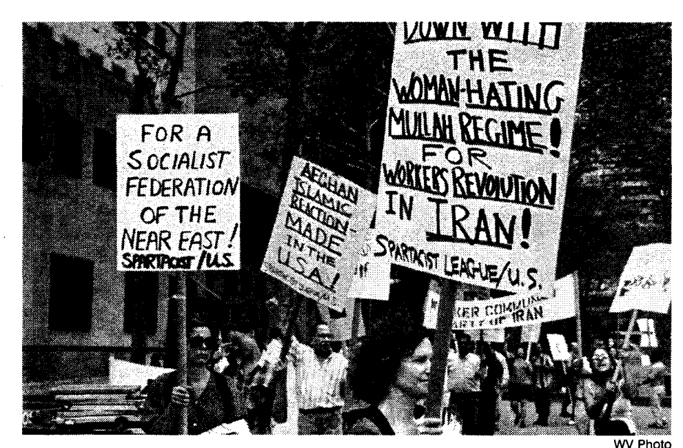
September 21: Spartacist contingent at NYC united-front protest outside United Nations against bloodsoaked Iranian regime.

against Kurdish nationalists. Only days before the WPI-initiated protests, Washington brought together the feudalist and petty-bourgeois nationalist leaders of the Kurdistan Democratic Party and the Patriotic Union of Kurdistan to broker a truce between these perennially feuding groups in order to further imperialist control of the region and bolster the CIA-sponsored "opposition" to the regime of Iraqi strongman Saddam Hussein.