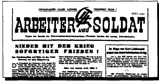
Jewish Trotskyist Abram Leon, author of Marxist analysis of the Jewish question, was murdered in Auschwitz after capture by Nazis. Trotskyist paper Worker and Soldier appealed to German troops in occupied France on basis of proletarian internationalism.

elements which were, at one and the same time, foreign to it and indispensable to it. Even before the peasant had left the village for the industrial center, the Jew had abandoned the small medieval town in order to emigrate to the great cities of the world. The destruction of the secular function of Judaism within feudal society is accompanied by its passive penetration into capitalist society.... "The highly tragic situation of Judaism in our epoch is explained by the extreme precariousness of its social and economic position. The first to be elimi-