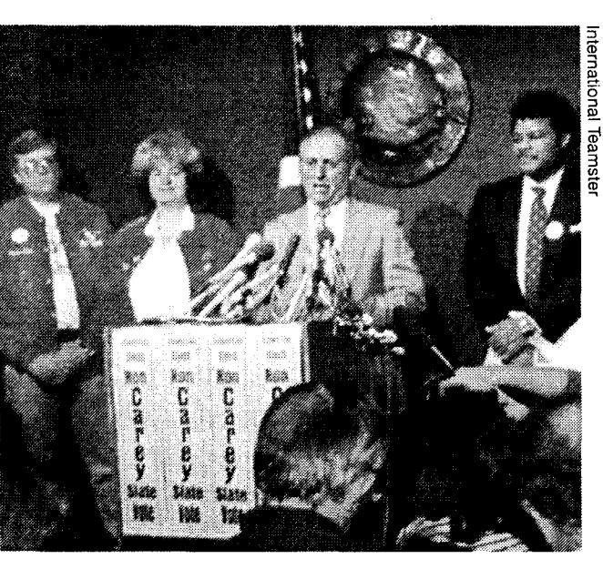
announces victory in government-run election for in 1991. Now feds have expelled him from union.

In its submissions in the RICO case in 1989, the TDU offered the capitalist union-busters a more efficient way to control the union than putting it in trusteeship, in which a handful of outsiders would face intractable problems trying to continued on page 11