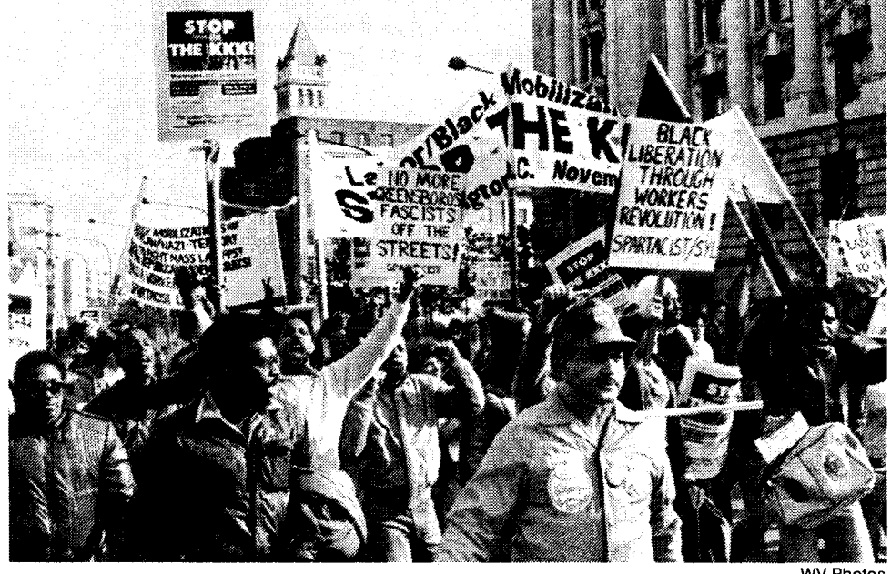
Spartacist League initiated November 1982 labor/black mobilization which stopped Klan from marching in Washington, D.C. (above) and July 1993 protests against racist discrimination at Denny's.

displace existing organizations, parties or campaigns." Though never stated in so many words by the congress organizers, it was obvious that the party they don't "intend to displace" is the Democrats!