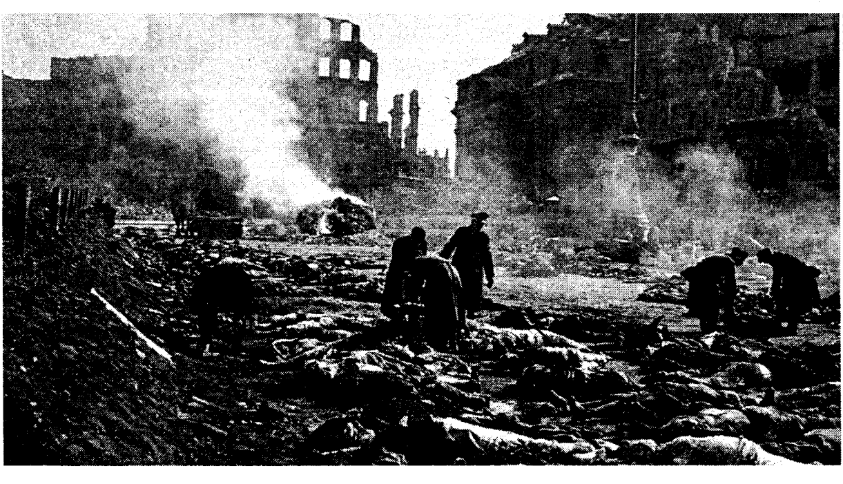
"Democratic" imperialists' war crime: February 1945 firebombing of Dresden by U.S. and Britain slaughtered over 100,000 German civilians.

A genuine reckoning with the causes and horrors of the Holocaust cannot come from ideologues for one or another imperialist ruling class—which have all perpetrated untold atrocities against working people, minorities and semicolonial peoples around the world—nor from the Zionist apologists for Israeli state terror against the Palestinian people. Nor can it be expected from the various pseudosocialists who seek to prettify the Social Democratic face of resurgent German imperialism. Only Leninist internationalists, fighting to reforge Leon Trotsky's Fourth International as the world party