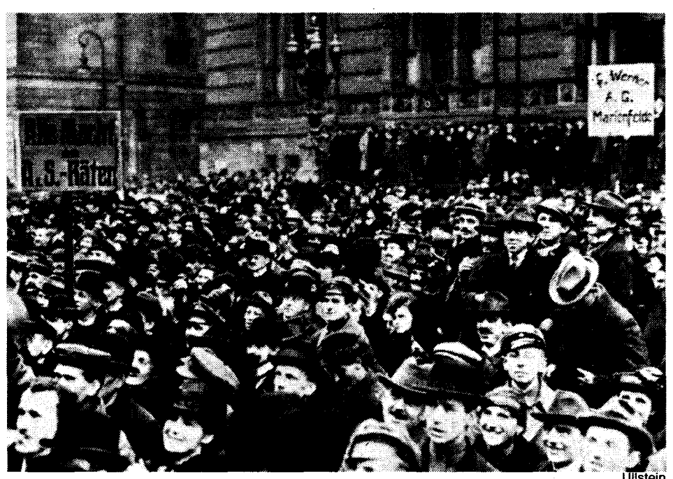
Spartakist uprising in Berlin, December 1918: Mass workers demonstration demands "All Power to the Workers' and Soldiers' Councils." SPD regime drowned proletarian revolution in blood.

It was precisely the precarious position of the Jewish people which impelled its best thinkers and fighters to place themselves in the front ranks of the radical-democratic bourgeois Enlightenment and, subsequently, of the internationalist, proletarian struggle for socialism. The October Revolution of 1917, in turn, confirmed in flesh and blood that only through the proletarian seizure of power could the Jewish people find