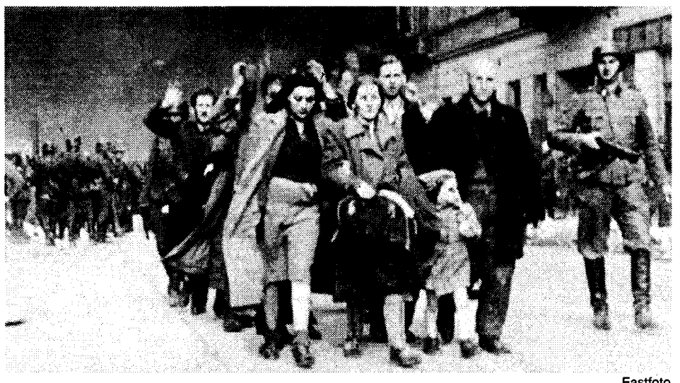
Top: Nazis round up Jewish survivors of heroic 1943 Warsaw Ghetto uprising for deportation to Treblinka death camp. Goldhagen book glorifies U.S. imperialist "democracy," but it was Soviet Red Army (below) which smashed Nazi regime.

The Goldhagen controversy has been fueled less by a historical dispute over the degree to which the German people were driven by a supposedly unique form of "eliminationist anti-Semitism" to