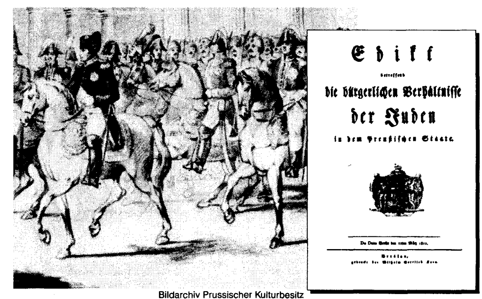
Napoleon enters Berlin in 1806. His military victory over Prussian aristocracy led to 1812 Emancipation Edict freeing German Jews from ghettos.

"Nationalism in economy comes down in practice to impotent though savage outbursts of anti-Semitism. The Nazis abstract the usurious or banking capital from the modern economic system because it is of the spirit of evil; and, as is well known, it is precisely in this sphere that the Jewish bourgeoisie occupies an important position. Bowing down before capitalism as a whole, the petty bourgeois declares war against the evil spirit of gain