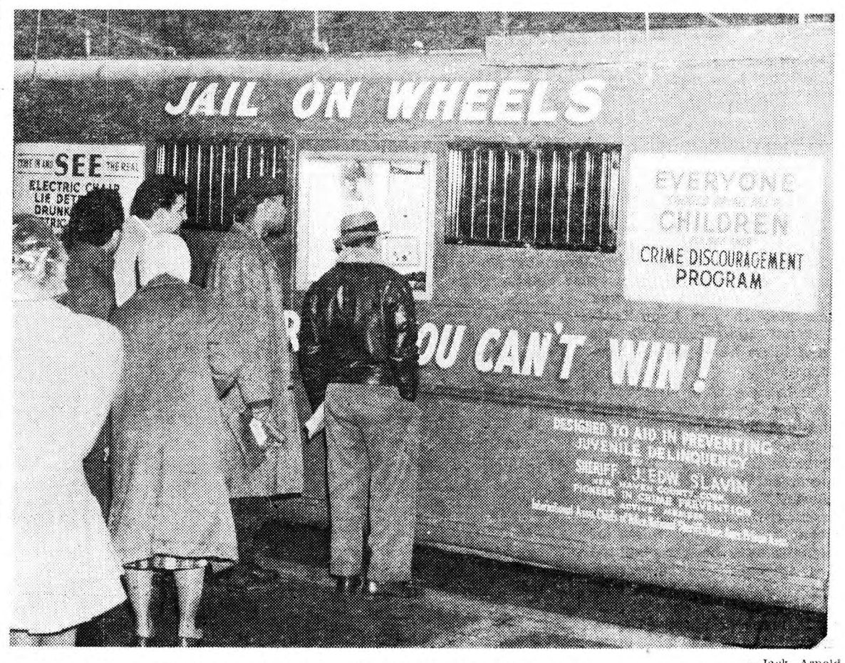
New Yorkers view display of implements of police brutality to discourage prospective juvenile delinquents. Authorities barred YS photographer from photographing electric chair.

Included among the groups which suported the boys and protested the whitewash of the patrolmen involved in the beating can Civil Liberties Union, which cinct organizations of the Demo-'Lower that door!' But all were police brutality in this case and