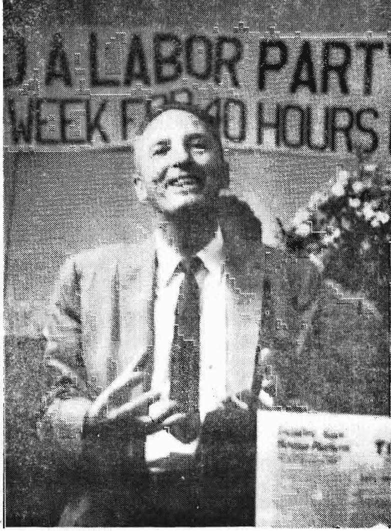
AT THE ROSTRUM: Socialist Workers Party Presidential candidate Farrell Dobbs addresses rally of Philadelphia workers and students.

A .-- The SWP campaign enables the socialist campaigners to reach