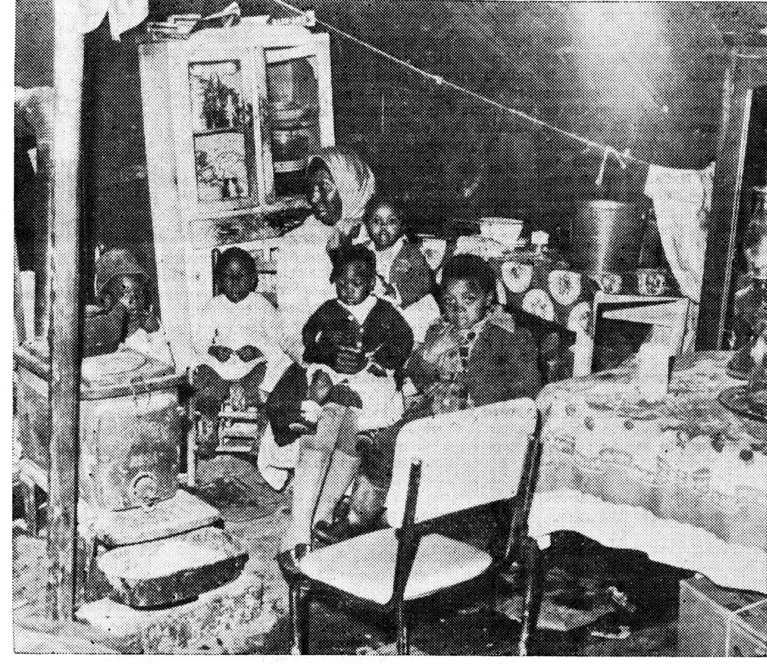
TENN. TENT CITY: A mother and her five children live in their "home" in Sommerville since their family dared to exercise the right to register and vote in Presidential elections.

Over 700 families have been countries as a result of adult memrecent national elections. Accordthe New York Post, "these people counties.