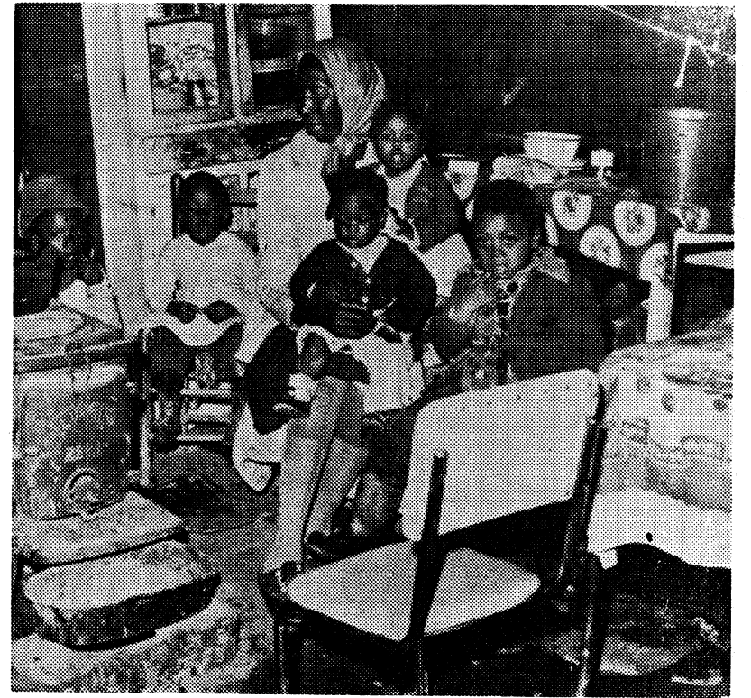
Negroes in Miss. Delta area suffer economic attacks for trying to vote, like this sharecropper family in neighboring Tenn., driven off land, living in tent.

"I admire Castro very deeply as a great American hero of the mid-twentieth century, and I feel pity and sorrow for him and for his government and people in this terrible crisis. I wish them suc-