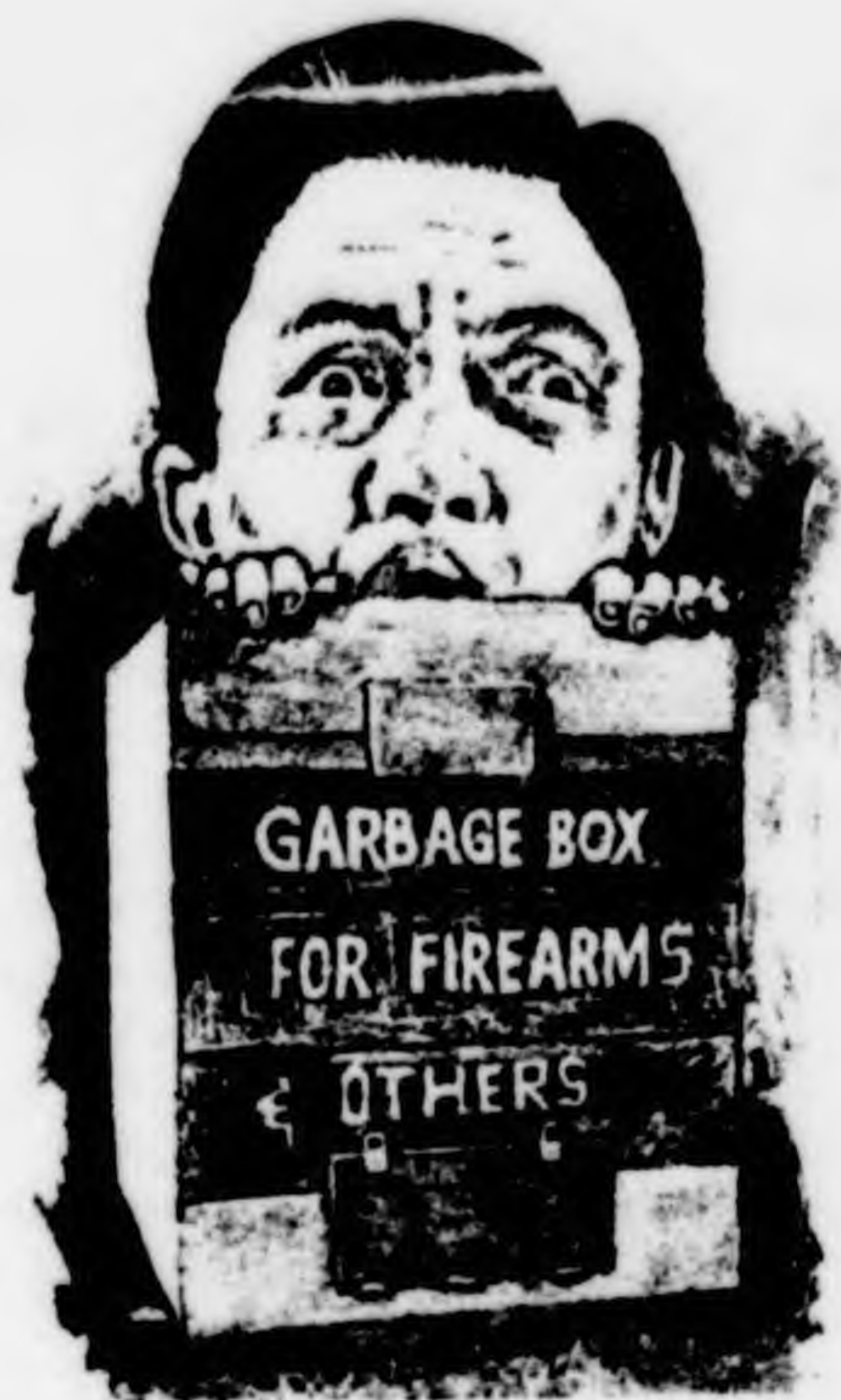
People's Liberation Artists (PLA '72)

Like their "Ma'am", the APP marauders picked out only the expensive gems, but unlike their mentor, they did not bother to send a thank-you note.