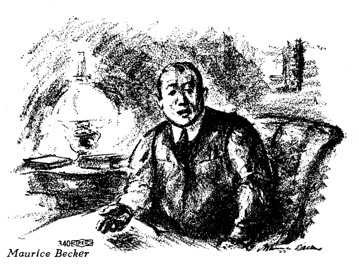
The Boss: "Union labels, yes; but scab government I must have."

The 1894 convention was held in Denver, Colorado. The People's Party had won a signal victory in gaining control of the state political machinery. Its candidate, Governor Davis H. Waite was in office, and he addressed to