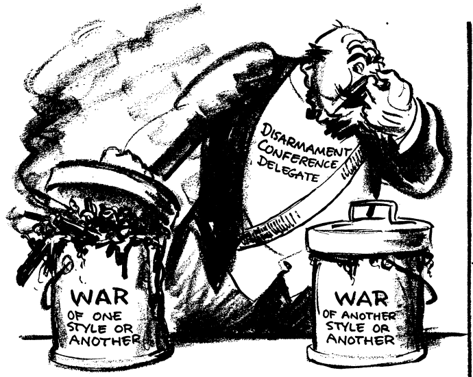
Diplomat: "Oof! This is awful; abolish it!"