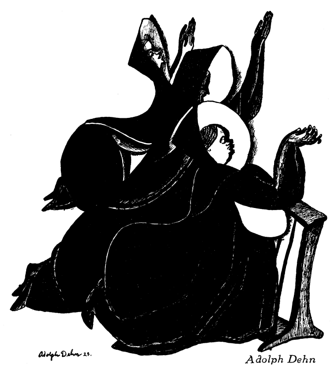
The Father Complex.

them. Dominating completely the policy of the Wilson Administration, they caused Secretary of State Colby to take a step unparalleled in the history of international diplomacy—to refuse to recognize the Mexican Government unless it should first sign a treaty acknowledging the rights of American capital. This was too crude. It amounted to an abdication of Mexican sovereignty, and Obregon's instinct warned him that he dare not sign it.