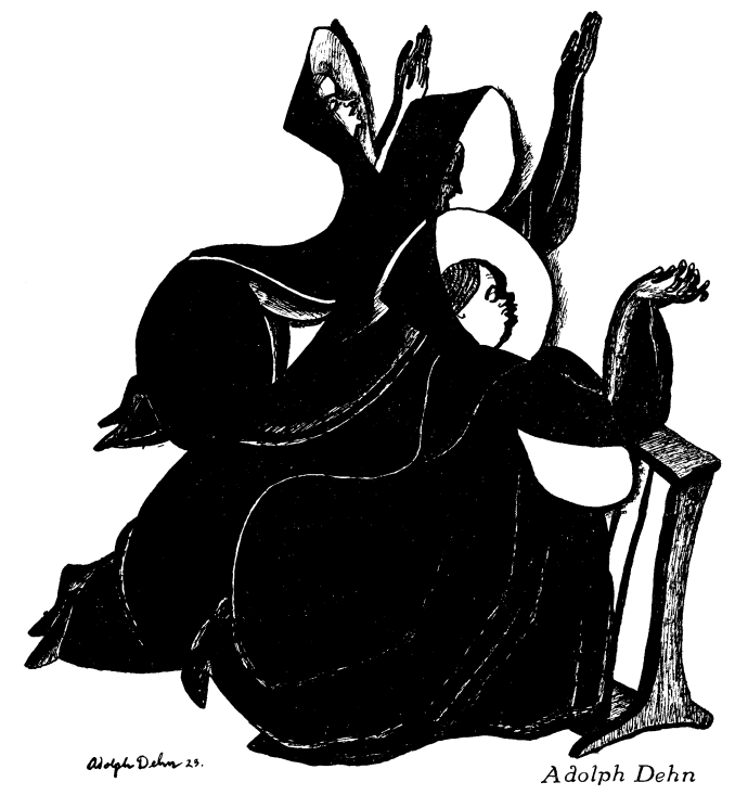
The Father Complex.