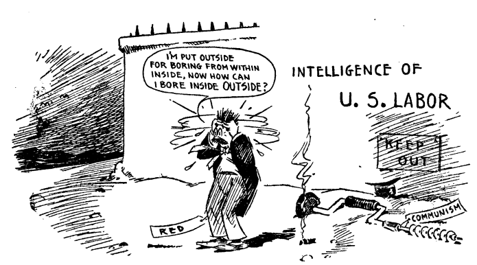
The Chicago Daily News expresses its solidarity with Gompers.

Mr. Gompers won, not a hundred percent, but a thousand percent. But what is the total result?