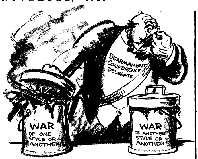
Diplomat: "Oof! This is awful; abolish it!"