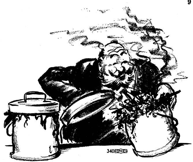
Same Diplomat: "Ah m-m, this is fine!"

for deterioration, and that all workers, including the managers, get proper compensation for what they put into industry."