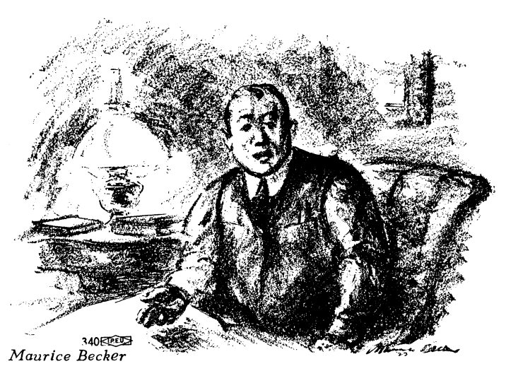
The Boss: "Union labels, yes; but scab government I must have."