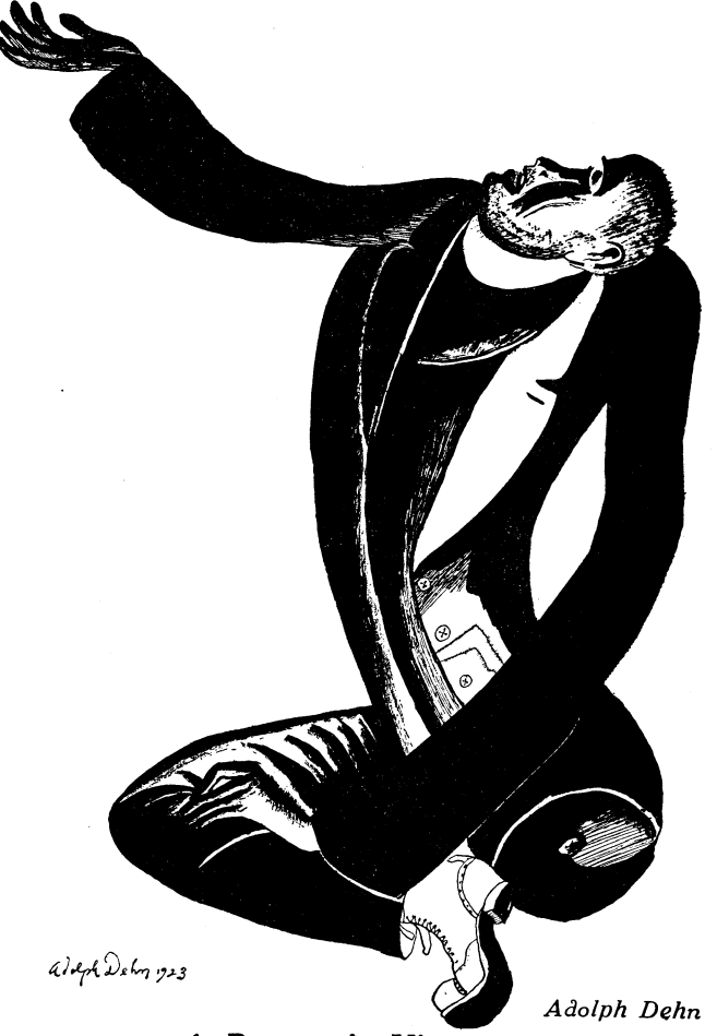
A Beggar in Vienna.

Mexico has been recognized—but not for Mexico's good. With greater and greater quantities of American capital pouring into the country below the Rio Grande, we may be sure that Wall Street will try to rule Mexico politically as well as economically. Mexican workers will be exploited more intensely than ever before. The law will be turned against them and their Constitutional privileges will be annihilated. Mexico has been recognized and the revolution is at an end! Already a new movement is arising in its place.