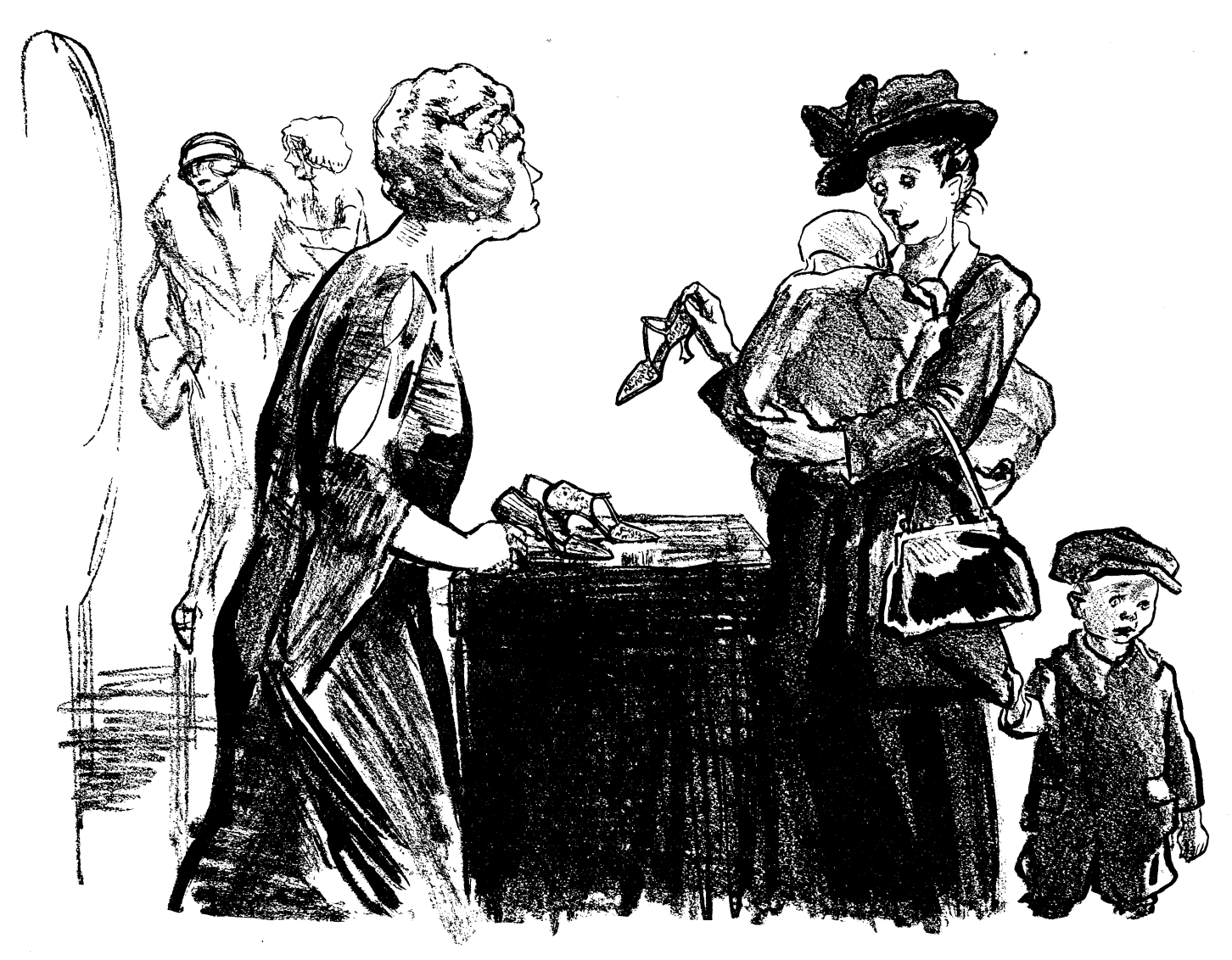
"Do you think these will wear well?"