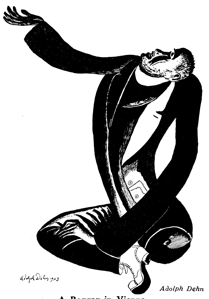
A Beggar in Vienna.