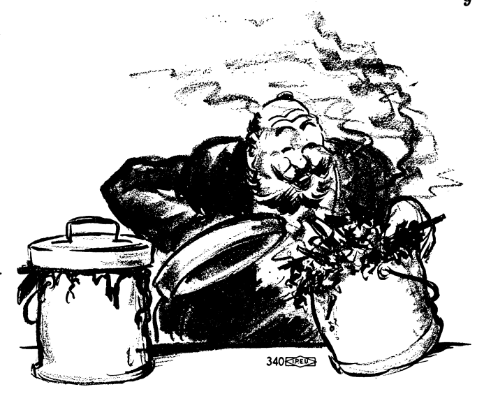
Same Diplomat: "Ah m-m, this is fine!"