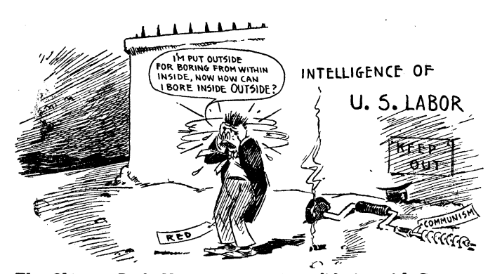
The Chicago Daily News expresses its solidarity with Gompers.