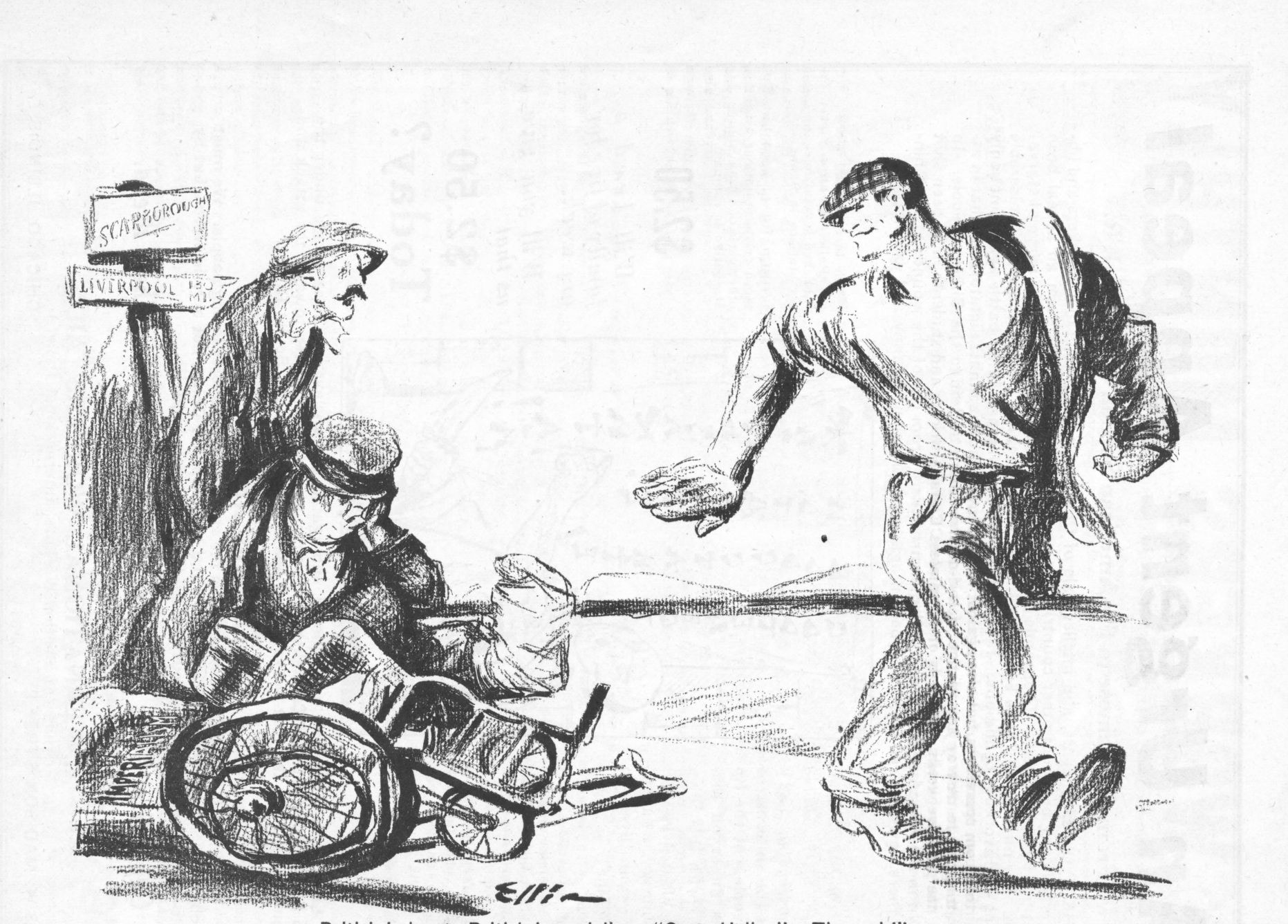
British Labor to British Imperialism: "Go to Hell—I'm Through!"