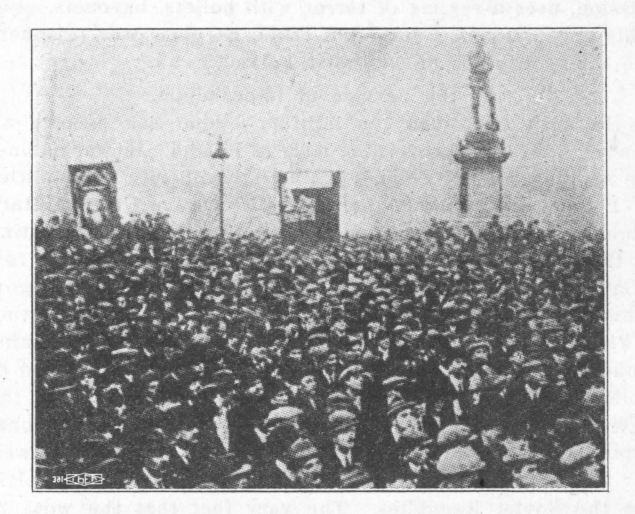
A Communist Mass Meeting in Hyde Park, London.

In all these activities the Communists are very active. Slowly and surely the Communist Party of Great Britain is learning how, by sheer merit and hard work, to win its real place in the labor movement. The leaders have left the old rut of sectarianism which so long beset British radicalism