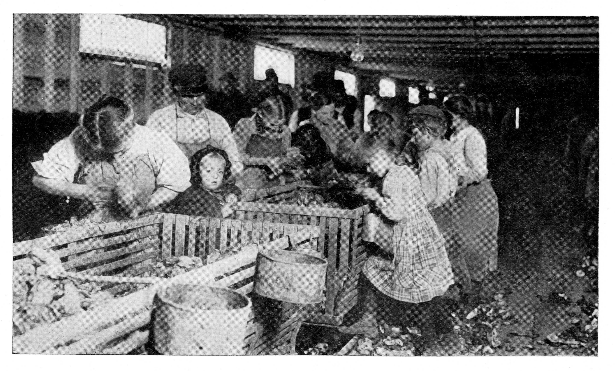
OYSTER SHUCKERS, EIGHT AND TEN YEARS OLD, WORK TEN HOURS A DAY.