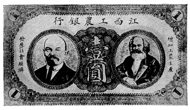
Chinese Soviet paper currency (one dollar), issued by the Kiangsi Workers' and Peasants' Bank. Printed on the bill are the slogans: "Increase the Industrial and Agricultural Production" and "Develop Social Economy."

The Provisional Central Government of the Soviet Republic of China, at its very foundation, also announced its "vigorous opposition to a new world war." The workers and peasants do not want war. However, imperialist powers, by bringing about war, by despoiling China and attacking the Chinese people, are forcing the Red Army of China and the Chinese masses to demonstrate again that the force of revolution is invincible.