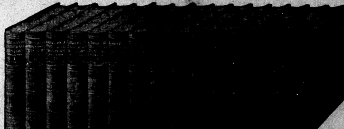
15 Volumes Edition De Luxe 5,000 page solid reading matter. 700 full-page illustrations. Bound in genuine Morocco English Crush Buckram, leather name plates.

The advance of Socialism and the salvation of our country depend upon the way in which we apply the lessons taught us by other nations. History foretells destiny. The errors of the past teach a vital lesson—they are the danger signals along the pathway of progress. Connect SOCIALISM with the lessons of history! The same forces which caused the downfall of the great nations of the past are at work in America today.