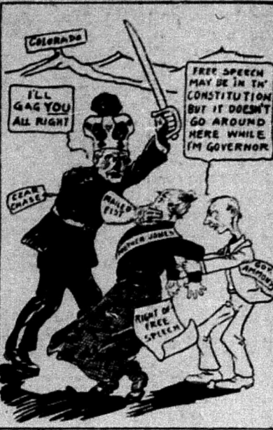
From Denver Miners' Advocate.