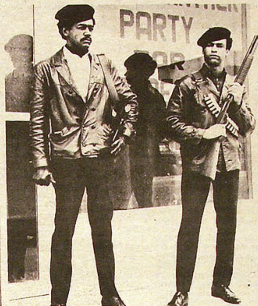
BOBBY SEALE AND HUEY P. NEWTON POLITICAL PRISONERS OF US FASCISM