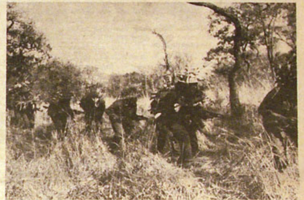
ZIMBABWE LIBERATION FIGHTERS

after all, is a people's struggle, not a platform for ideological diplomats. As such the people, the true heroes of this revolution, have a right to ask themselves the question: What after independence? And those who would seek refuge in militant racism ("We must have our country from the Whitemen") must be exposed with courage for the opportunists they are, because of such stuff are born the wealthy Black bwanas of the era of post independence. What after independence? is a question so crucial it can only be answered