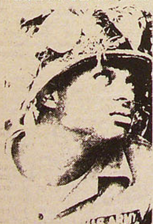
PRISONERS OF WAR FOR POLITICAL PRISONERS

You, the wives of American Prisoners of War, should go to the people that your husbands have been oppressing and beg for forgiveness. The wives and children and love ones of Black Political Prisoners have asked the rulers of this fascist system for justice and they have never received any. ALL POWER TO THE PEOPLE POW'S FOR PANTHERS "ABU" (Shakur) Father of Political Prisoner in Babylon