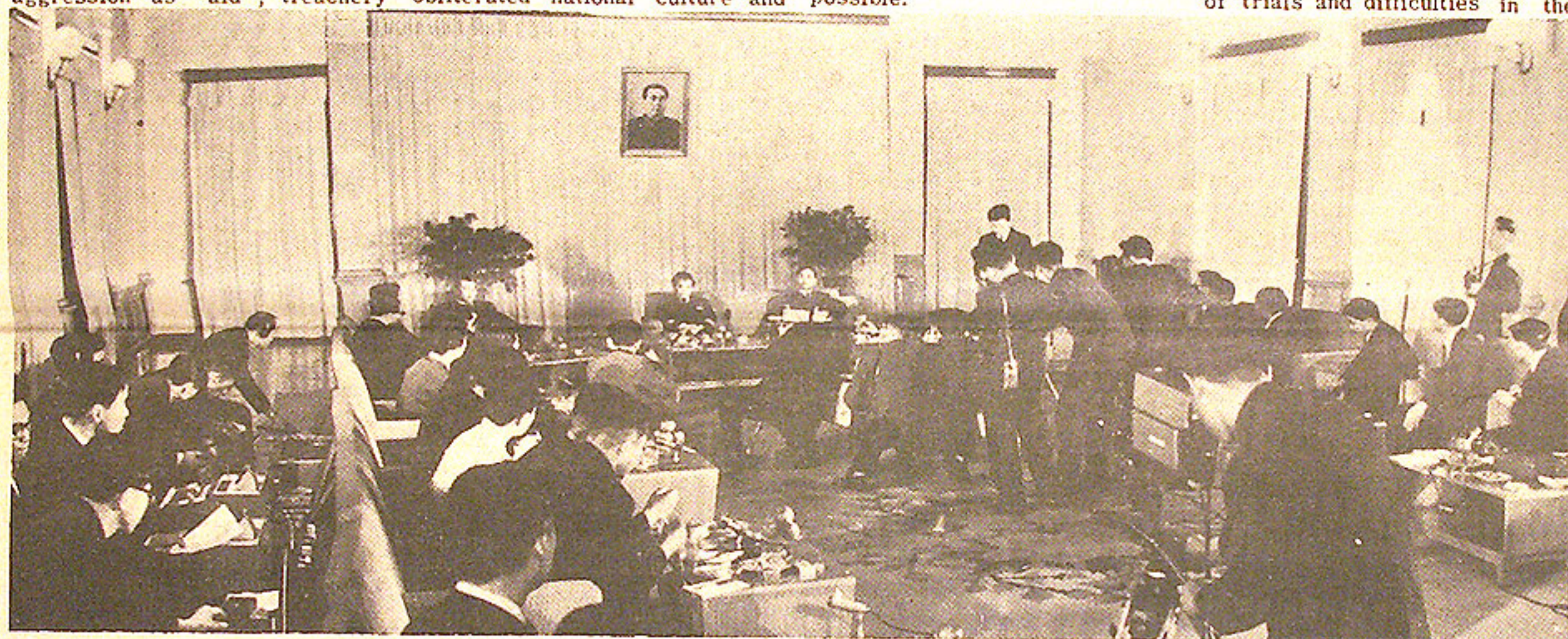
PRESS CONFERENCE — SOUTH KOREAN PILOTS HIJACK PLANE TO NORTH KOREA

Comrade reporters, have you anything more to ask? Well, a lot of time has passed. We should like to close the press conference of today.