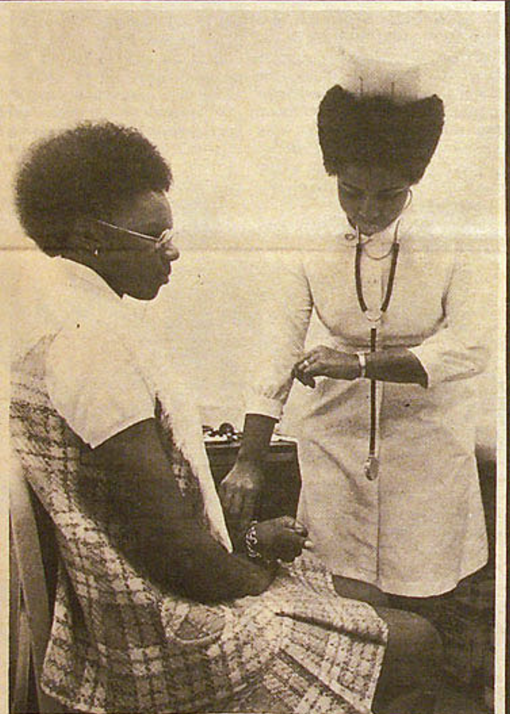
FREE MEDICAL CARE FOR OUR PEOPLE

this as something separate from society at large; this is merely an extension of the genocide being practiced on the streets of this country. If something is not done to stop this brutality at this present level, then the practice of shooting directly into a crowd of unarmed people may be adopted by the "guards" on the streets. The killing of convicted criminals may seem removed from us here who do not live looking out of prison bars, but who knows when prison methods will be used against us. We must move now to halt this type of behavior that shows absolutely no regard for human life on the part of public servants or face the disastrous results. ALL POWER TO THE PEOPLE Judi Douglas