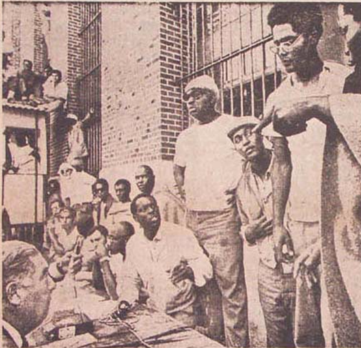
COMMISSIONER OSWALD STALLED PRISONERS, UNTIL NIXON GAVE THE WORD.