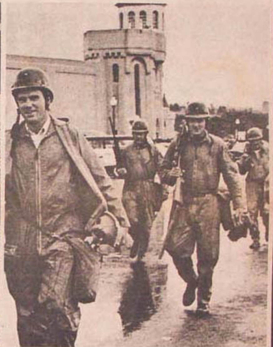
STATE TROOPERS AFTER MILITARY ASSAULT ON ATTICA.

Attica Prison in New York became the focal point for the exposure of this country's full turn toward fascism. The men that were killed there on September 13, 1971, all knew, in varying degrees that the state had no concern for their lives.