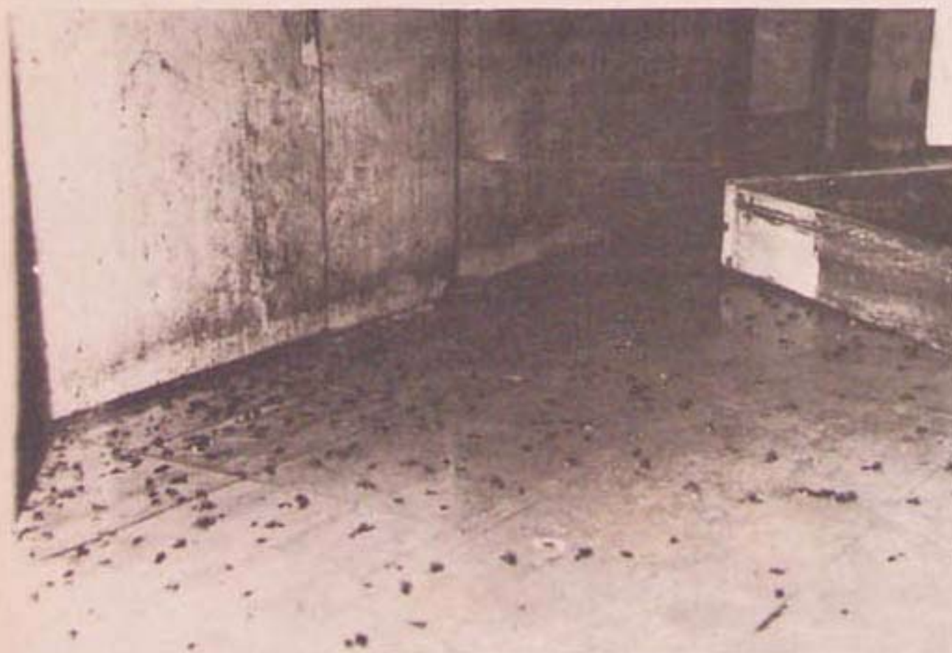
Decent housing is a human right.