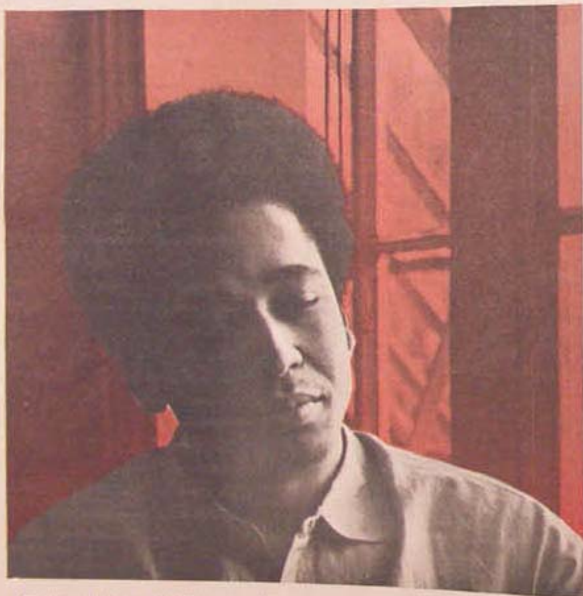
COMRADE GEORGE JACKSON, FIELD MARSHAL, BLACK PANTHER PARTY