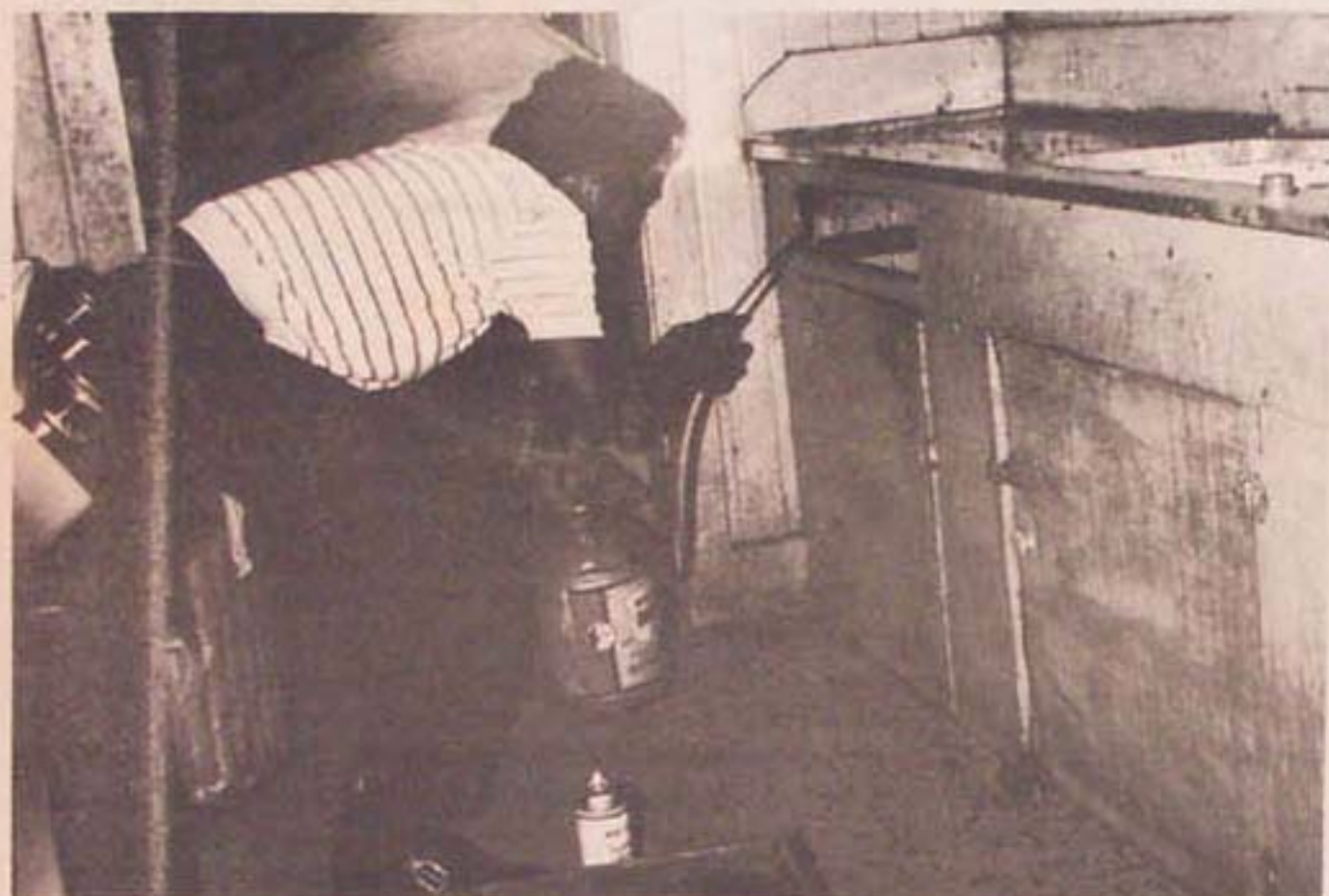
Comrade from Houston Branch rids house of disease-carrying pests.

ALL POWER TO THE PEOPLE Houston, Texas Branch Black Panther Party