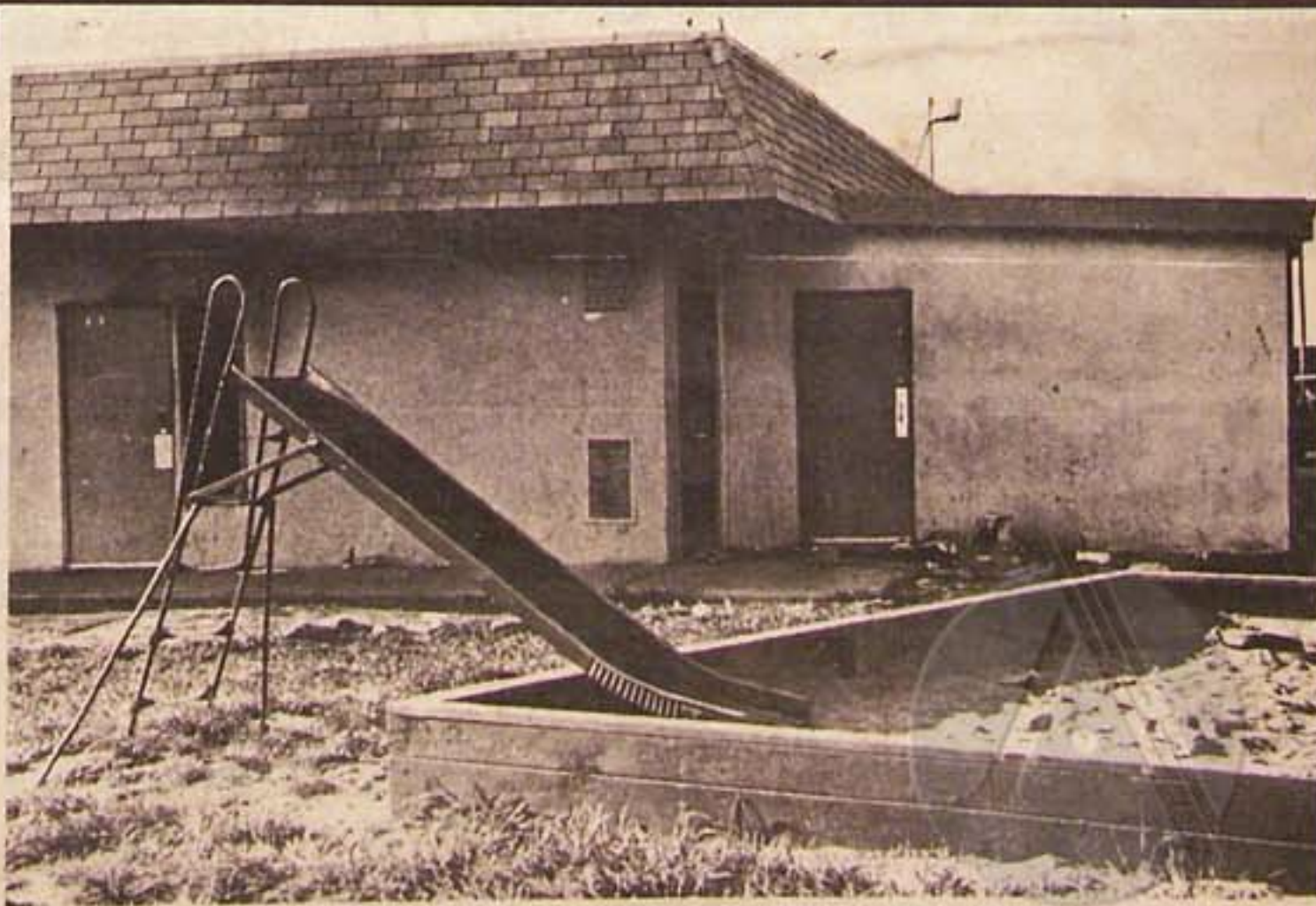
THE ONLY PLACE TO GO - DESTROYED.