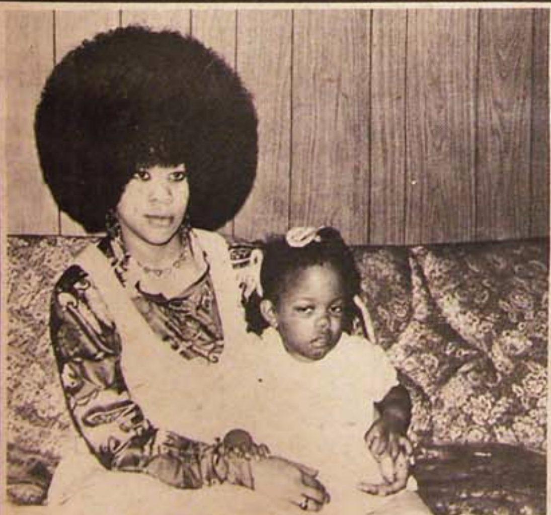
AN INNOCENT DAMAGED.