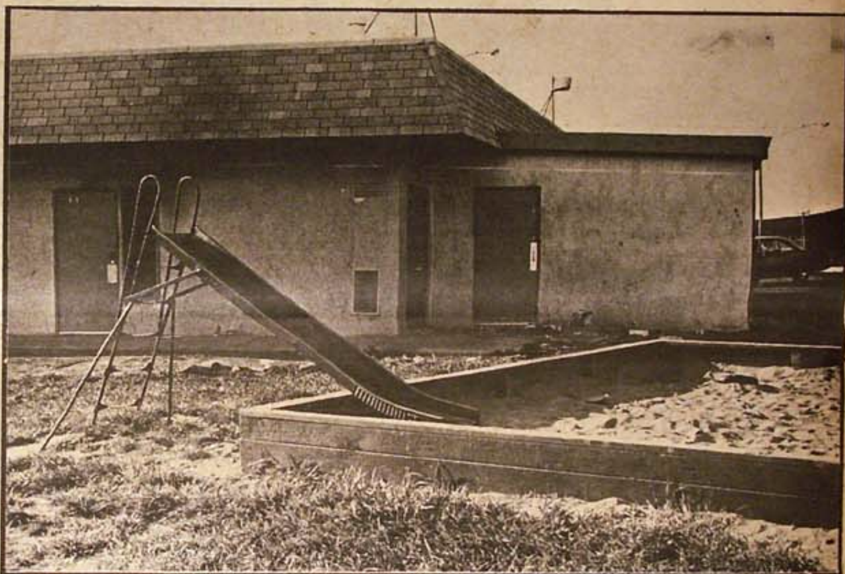
The City closed the only recreation facility down, to be reopened under City authority. On March 12th, 1972, instead of reopening, the center was gutted by fire.

4 years ago, concerned community members initiated and carried through the building of a small recreation center for the youth of Country Club Crest. Until recently, the Country Club Crest Improvement Association (CCCIA), the organization formed out of this united effort, was housed in that recreation center. People were trying to create for themselves a decent place to live and trying to enjoy that living.