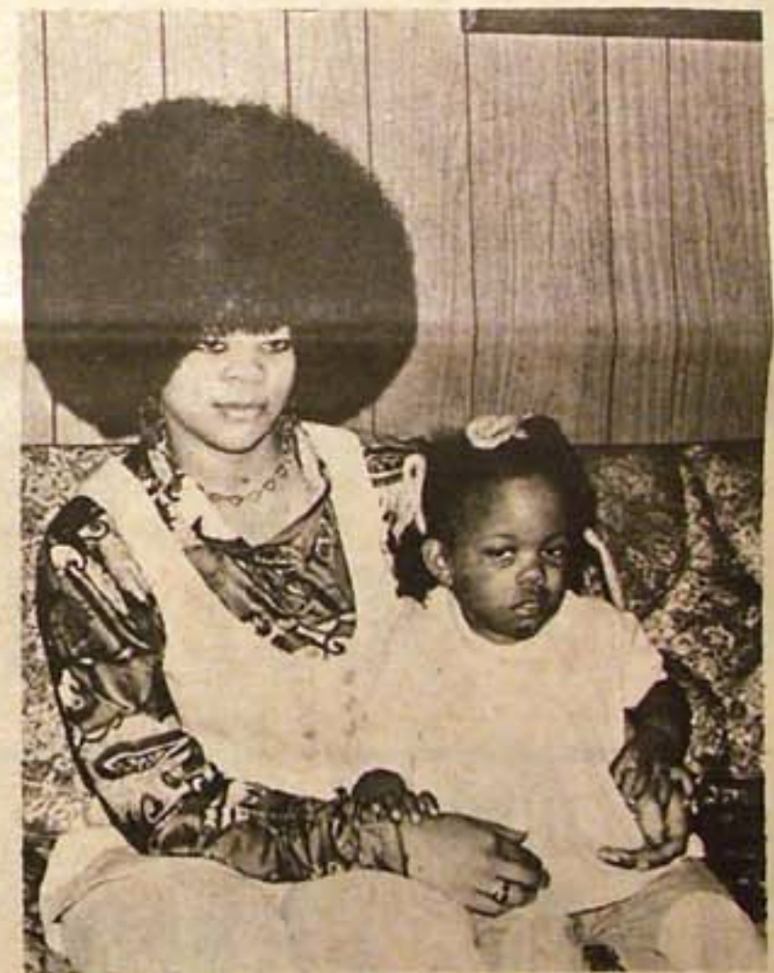
Twenty-two month old Black baby girl injured by tear-gas canister.

By this time, in keeping with the practice inside Black communities in general by most pig agencies, the Vallejo Police Department quickly turned events to justify further repression and intimidation of Black youth. On Monday night, March 13th, the Vallejo Police, the County sheriffs and the California Highway Patrol converged on the Country Club Crest Community and ordered everyone, the youth in particular, to clear the streets. They arbitrarily teargassed several homes, beating men and women alike. They beat anyone who even appeared to resist their "directives". In an effort to break up what they alleged to be a gang of hoodlums that had gathered at the home of the John Boyden family, the police indiscrim-