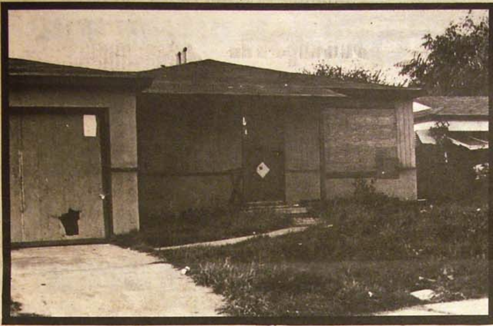
Houses have holes in the walls, ripped out piping, torn-up walls and floors and are lacking major appliances. Only four-years old, many houses have been classified as sub-standard.