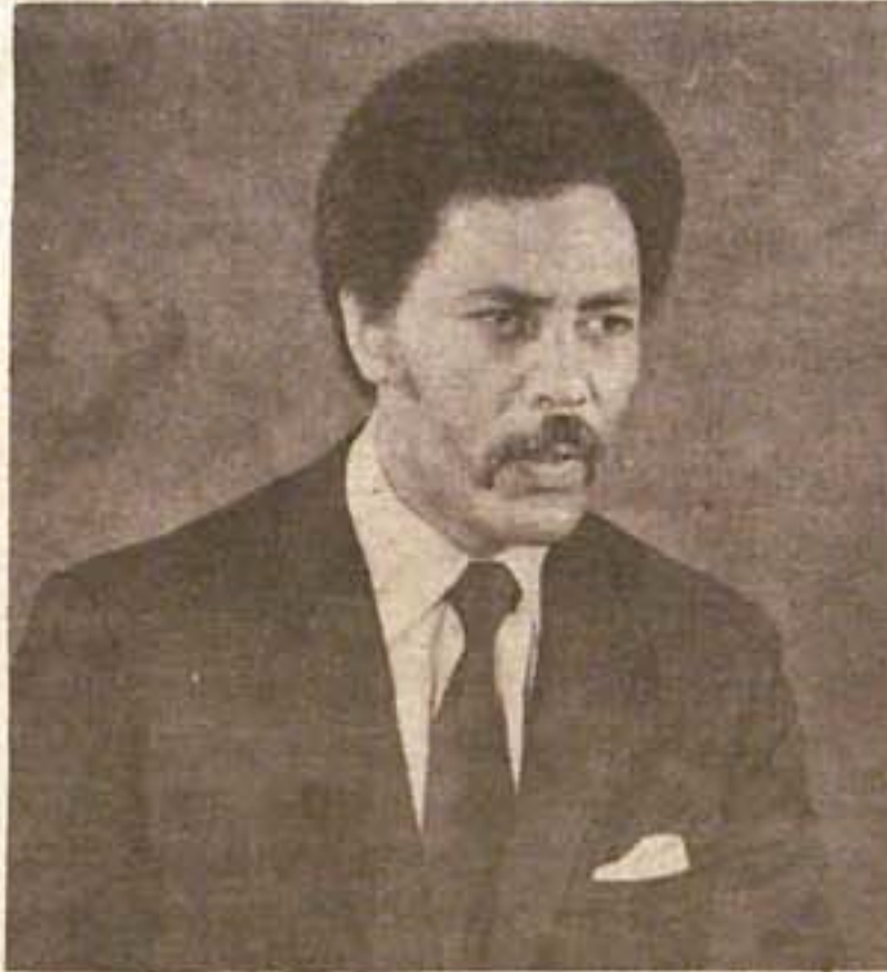
For demanding a decent medical-care program, U.S. Congressman Ron Dellums was said to be trying to "creep socialism" into Congress.

U.S. Congressman, Brother Ron Dellums (California's 7th Congressional District), has, for the past week, been demonstrating even more his concern for the rights of the people, as well as his fearless position in opposition to all those who trample our rights as human beings.