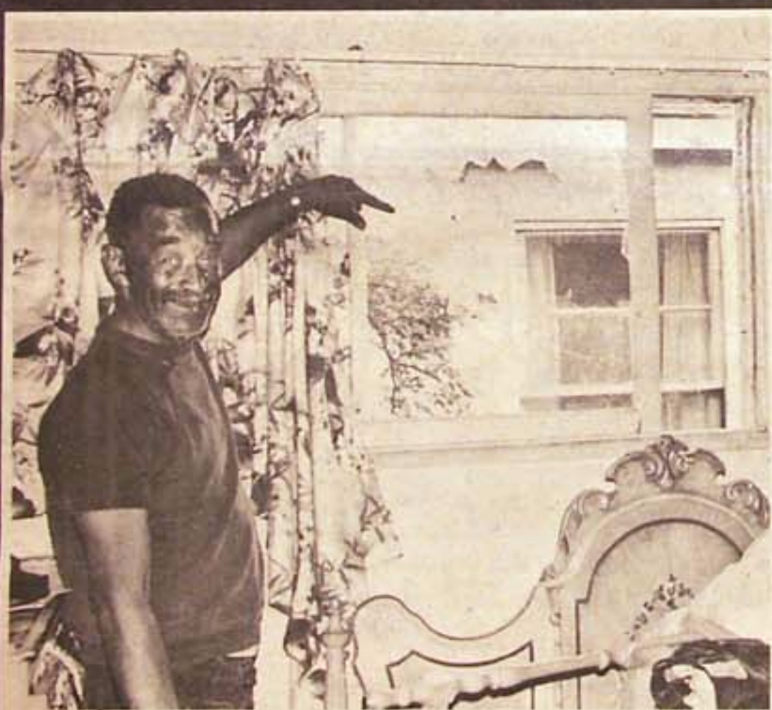
A HOME ASSAULTED.

VALLEJO, CALIFORNIA BLACKS STRUGGLE FOR COMMUNITY CONTROL