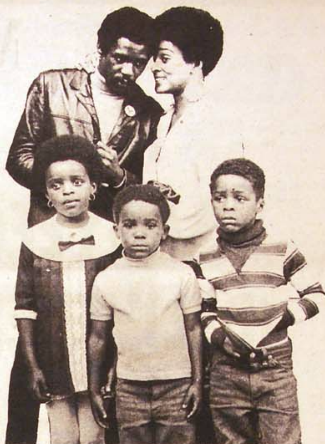
DAVID HILLIARD with his family before being railroaded to prison.

CONTINUING THE BLACK COMMUNITY SURVIVAL CONFERENCE IN COMMEMORATION OF DAVID HILLIARD THE CHIEF OF STAFF OF THE BLACK PANTHER PARTY, ON HIS BIRTHDAY