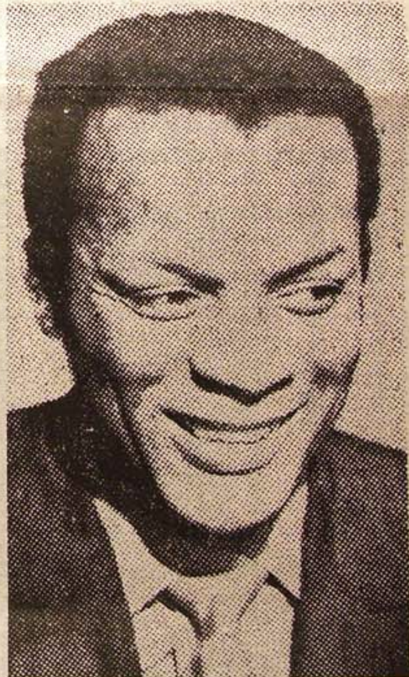
BROTHER CURT FLOOD vanguarded the just protests of Black baseball players.

Finley has said, when asked about Brother Vida, "I won't trade him and I won't sell him. Either he accepts what we have offered or he's through in baseball." As recently as April 16, 1972, Finley further stated that "you can't treat one ball player different than the other 24. I'd rather lose money at the gate than give one ballplayer special favors." Indeed,