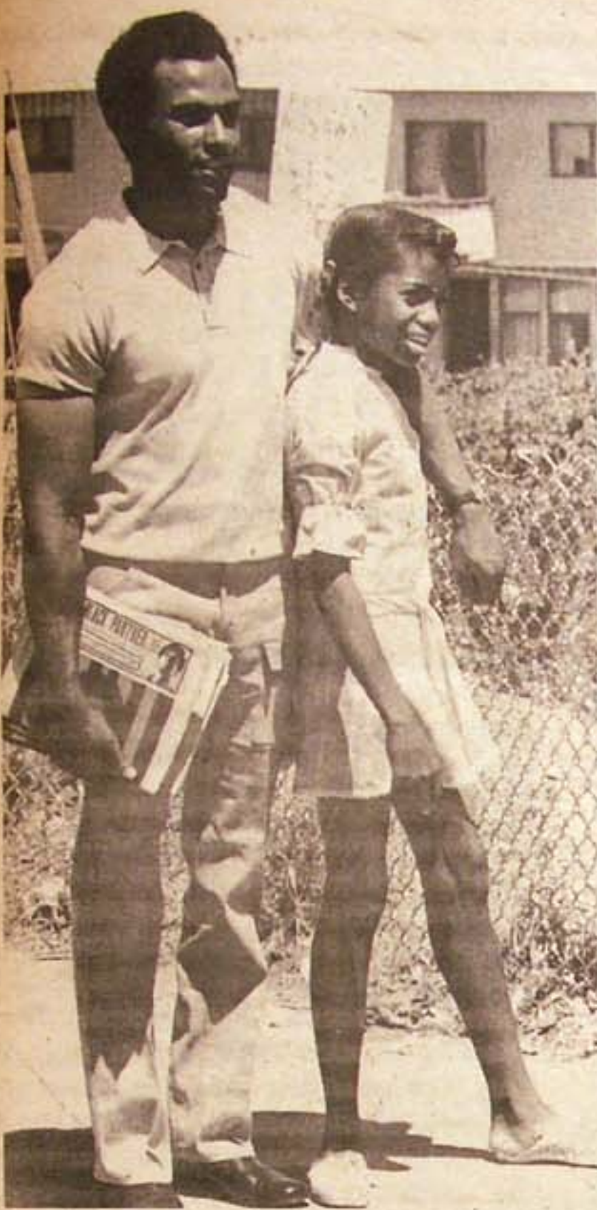
The people know he's got soul; but "soul" radio station KDIA allied with the pigs against him.