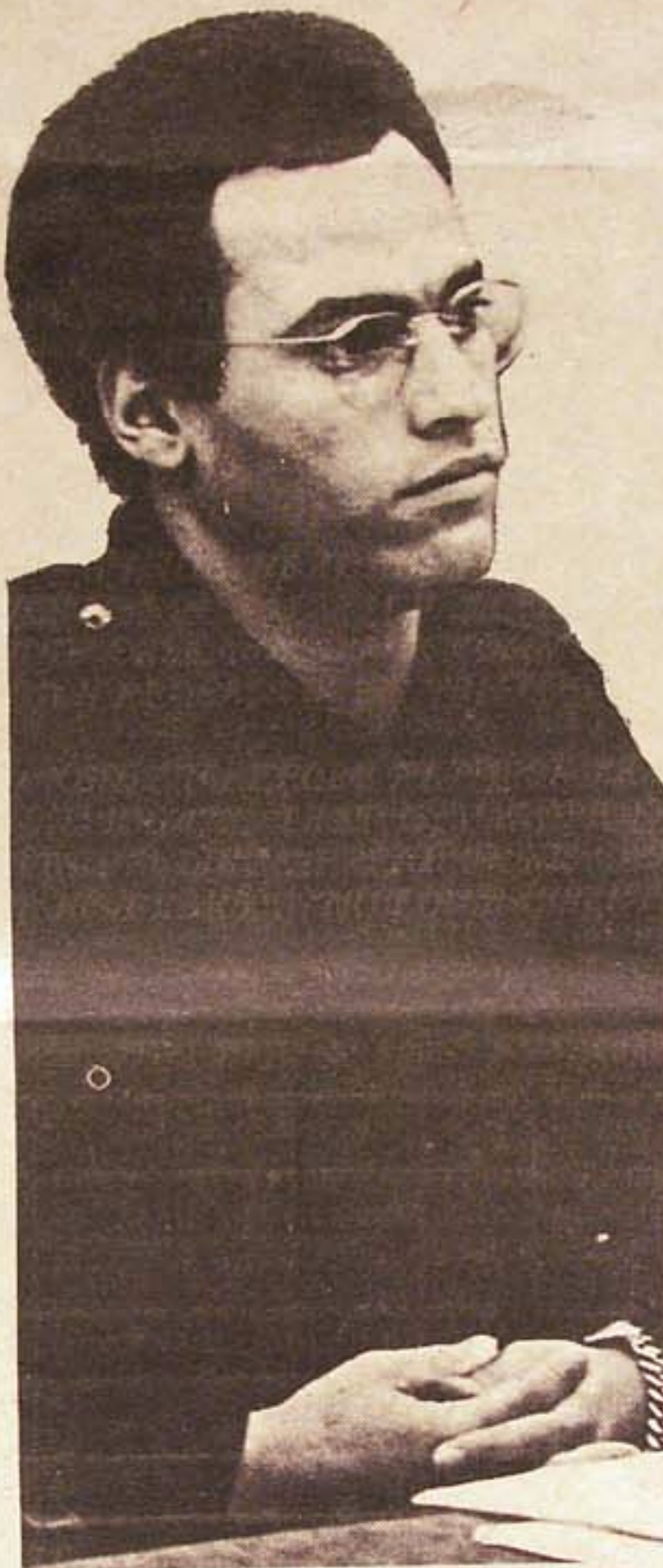
HUEY P. NEWTON, SERVANT OF THE PEOPLE, FOUNDER, CHIEF THEORETICIAN AND LEADER OF THE BLACK PANTHER PARTY.

Threatened by the forecast of greater community strength and unity from this alliance, the ruling circle moved quickly in its attempt to embarrass the Black Panther Party and sabotage Sister Shirley's campaign. Local Oakland (California) gestapo police even parked out in front of St. Augustine's Church (where the press conference was being held) for the duration of the press conference.