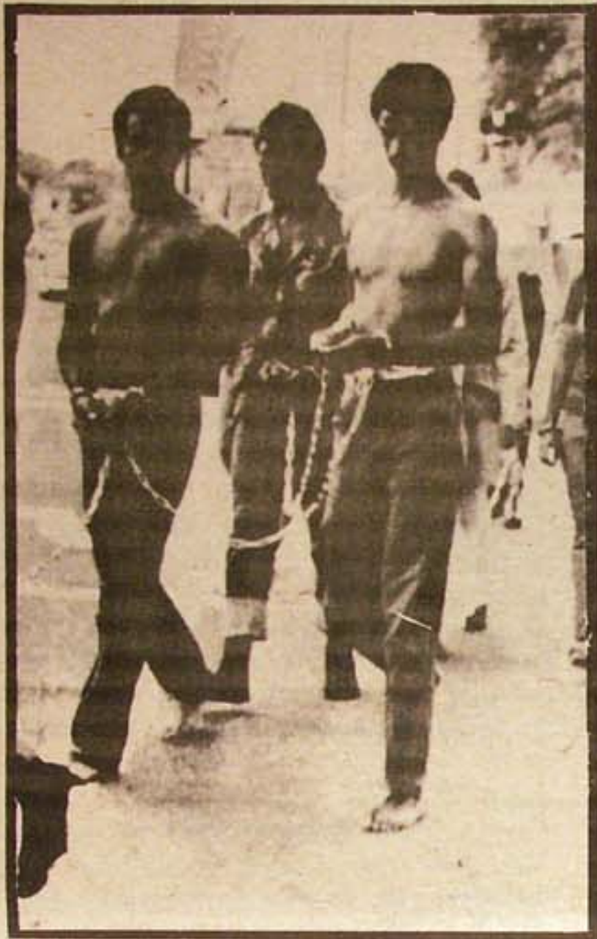
America must stand trial by the people for its assault against the Republic of New Africa.