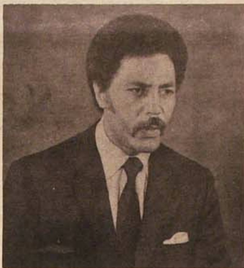
Congressman Ron Dellums has been one of the strongest voices, along with the BART Black Caucus, for an end to minority injustice.