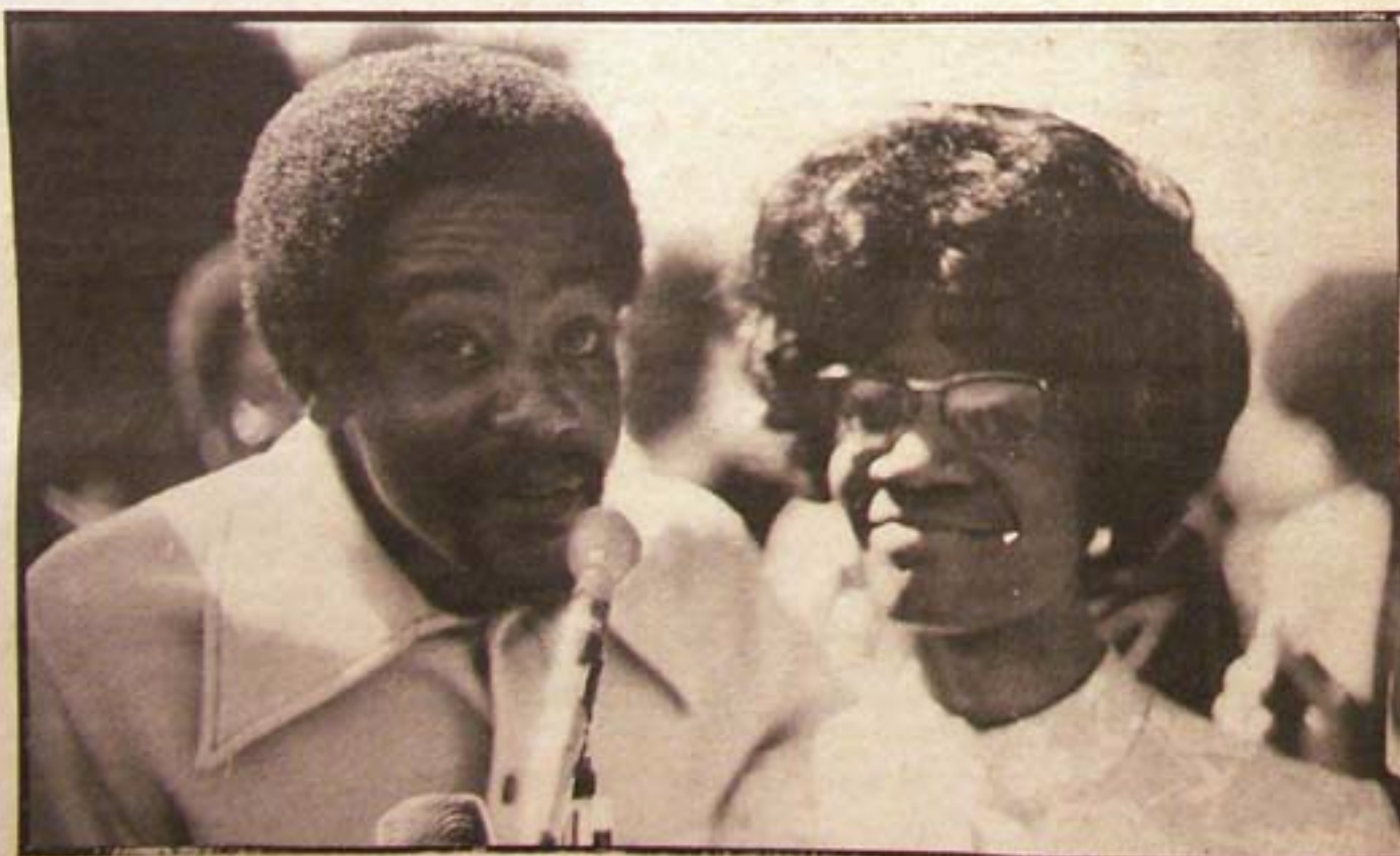
CHAIRMAN BOBBY SEALE AND SISTER SHIRLEY CHISHOLM STAND TOGETHER ON THE ISSUE OF SURVIVAL.