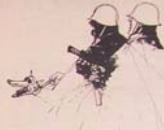
RECENTLY, UNDISCLOSED CONSPIRACY AND SECRETLY MANIPULATED EVENTS

The Anticipation "holding pattern", the premature "head-off", O'Hare's "forgetting", the redirection to 13-L, all were part of the long list of accounting failures, ac-