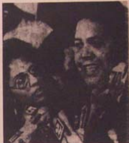
HAYNARD JACKSON favored to win the Atlanta Mayor's seat in the upcoming run-off election.