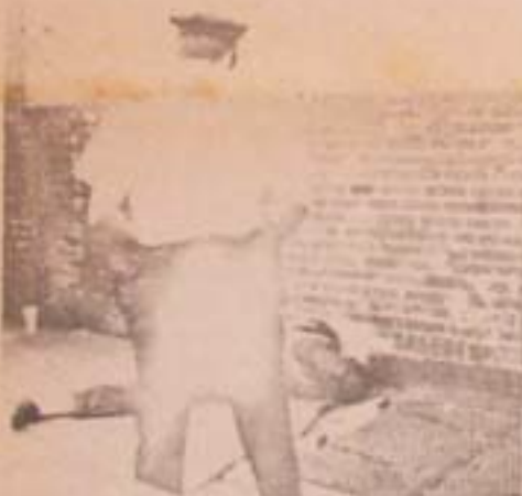
The killing of Black people by racist policemen is a common occurrence in America.