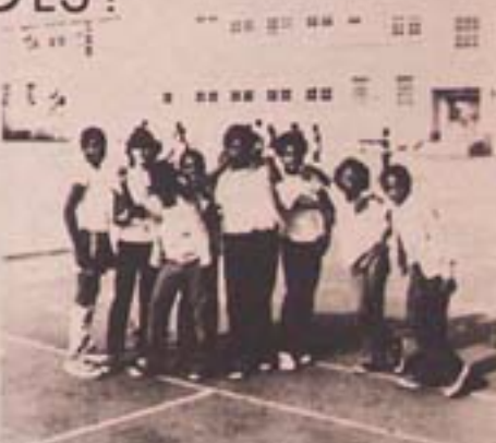
Oakland public school children, like those at Havenscourt Junior High School in E. Oakland, face new police abuse.

The initial ideas to implement CIA came from an Alameda County Grand Jury study on problems within the