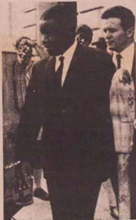
Brother NDABARINGI SITHOLE, jailed ZANU President is confident in his struggle for Zimbabwe's freedom.

"At the present time the British government says that there is no basis for the convention of a multi-racial constitutional conference on Zimbabwe.