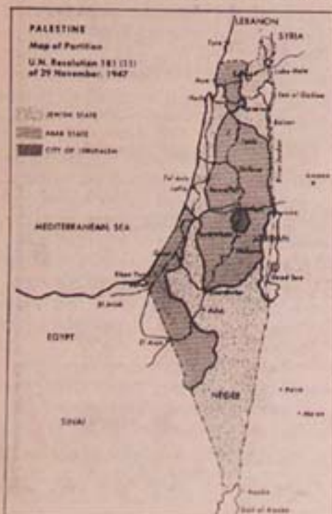
Zionist aggression since 1947 has made a mockery of the above U.N. Partition plan. (See Editorial, page 2.)