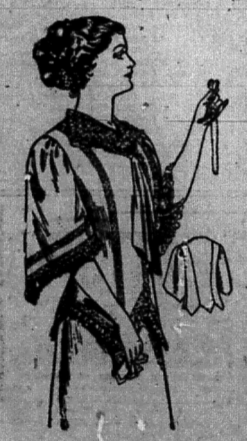
LADIES' SEMI-FITTING DRESSING SACK