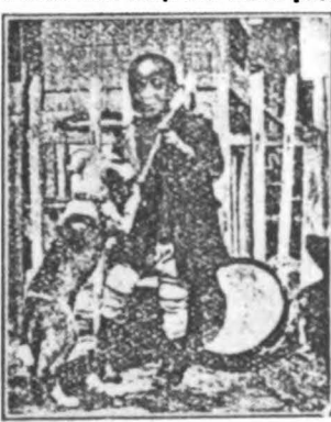
THE DRUMMER BOY AND HIS DOG

A book that will help the most prominent member of society or the most humble.