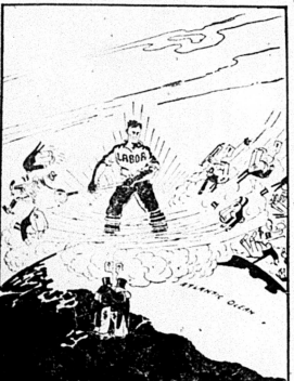
Labor's Big Job