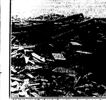
All that was left of part of working class district after storm hit West Frankfort, southern Illinois coal mining town.

still live. The new home like the old one will hardly keep out the rain and the snow, let alone stand against the next tornado's blast.