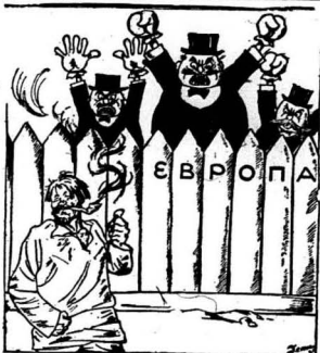
The capitalist governments of Europe are trying to scare Soviet Russia with military conferences, the "Security pact", etc. But Russia can afford to smile at these scares. The Red Army is always ready to meet unwelcome guests.

America also participated in the financing of European commerce and industry.