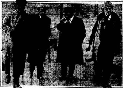
Some of the leading figures in the Russian Communist Party and the Communist International. Left to right: Stalin, Rykoff, Kameneff and Zinoviev.

import capital. This necessary capital is today controlled by certain leading national capitalist groups.