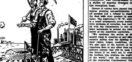
The Workers' Fleet Goes Into Maneuver.

Class solidarity of the Melbourne unions protesting against the continued imprisonment by the United States government of great numbers of labor unionists, particularly the seaman of I. W. U., was expressed in California, resulting in a complete boycott of the fleet in so far as any public demonstration was concerned.