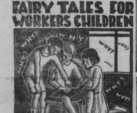
BY HERMINIA ZUR MUHLEN TRANSLATED BY IDA DAILES

With over twenty black and white drawings and four beautiful color plates and cover designs by Lydia Gibson.