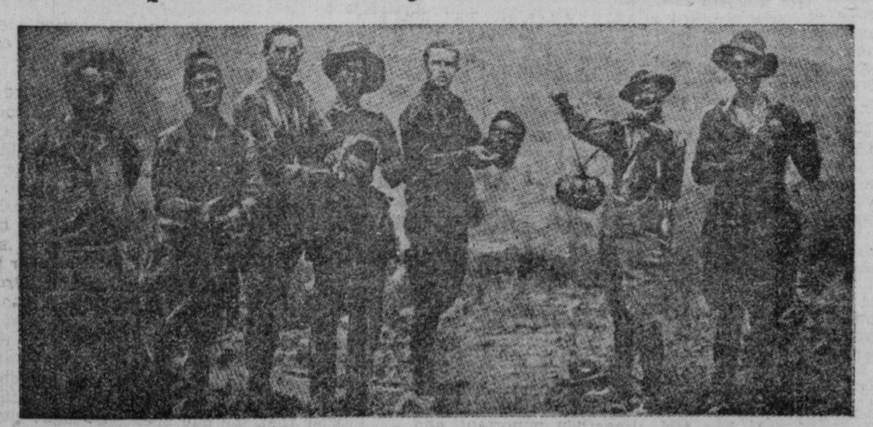
How the French Army Carries Civilization Into Syria. A picture taken from "l'Humanite," the French Communist Party daily paper showing French soldiers playing with the severed heads which they have cut off of their victims.