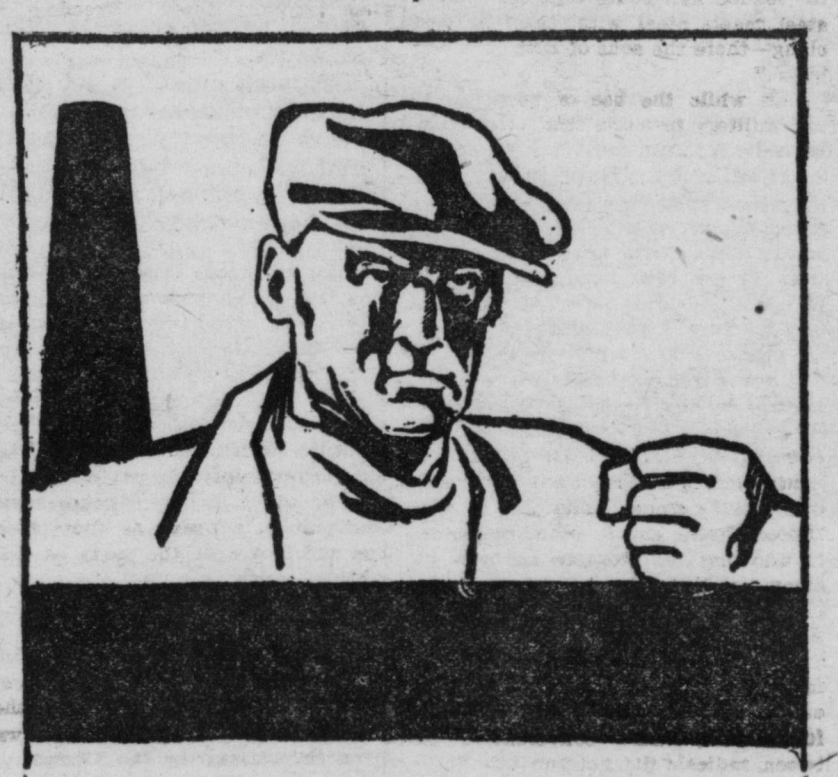
BRITISH LABOR: The General Strike Will Come Again!

If the author of that article should read one of our collective agreements he would find much that is not stipulated in American collective agreements, for which reason, as we know positively, the American trade unions which are affiliated to the Federation of Labor enjoy much greater favor of the American capitalists than the Rus-