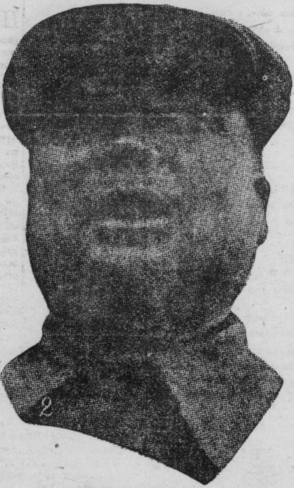
FENG YU-HSIANG. Commander of First People's Army.

name of treaty tariff, or conventional g. The right to fortify certain strategic points is lost.