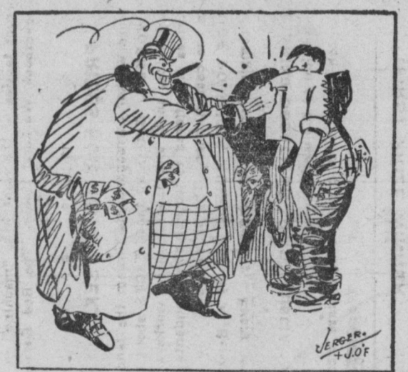
Boss to Slave as he pins on Loyalty Medal: "Your name will be in the next issue of the Monthly Fertilizer!"

power and importance. The employe magazines are planned to serve these ends. Many of them are issued in plants having company unions, and these devote considerable space to the "benefits and advantages" of the works' council, accounts of meetings of employe associations, etc. To keep the worker from feeling he is only a cog in the machine, driven for profit making, the magazine describes the process of manufacturing so that he may see the "romance" of the entire achievement, and take pride in his workmanship. To develop his loyalty to the firm, he is told how it grew, what dangers and risks were encountered, and how the devotion and sacrifice of the workers brought it to its present state.