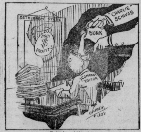
Priming Him Up.

IN/ITH the aim of obtaining increased production of a better quality at a lower cost, employers have adopted the tactics of obtaining the workers' consent to this form of intensified exploitation by diverting their attention thru various paternalistic schemes and poisoning their minds with illusions of