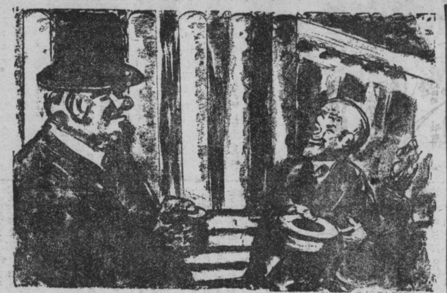
Poincare Passing the Hat.