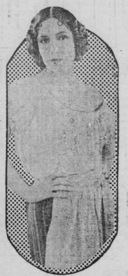
Dolores Del Rio, Mexican actress, in a leading role in "What Price Glory?"