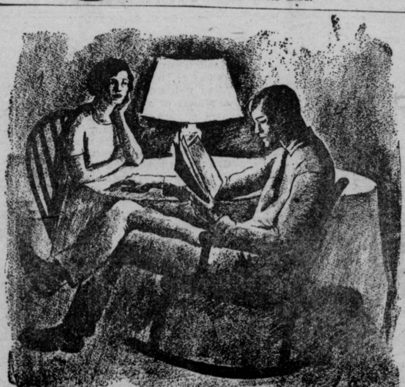
-Drawing by Lydia Gibson

"Miss Calico" is just an evening of light and spirited entertainment. Excellent in its kind.