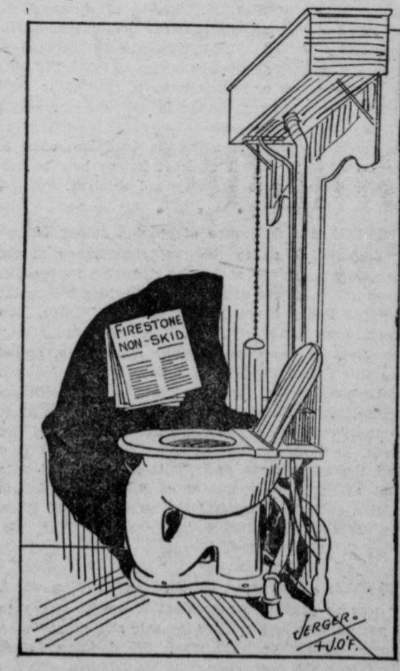
Where a Company Paper is Useful,

THESE journals, however, are bound up with the policy of class collaboration. It is significant that the spread of employe magazines has closely followed the development of company unions. Both are branches of the same tree, finding fertile soil in unorganized industry. The company union binds the worker organizationally to the employer, carrying out his production program as concerns wages, hours, output, etc. The employe magazines artfully propagandize the workers to accept this program, or similar programs in plants having no company unions. The main attack, therefore must be directed against the entire practice of class collaboration.