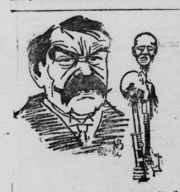
Chamberlain: Thru my participation in the

superior force. After his band of followers had been broken up Holz fled to Czecho-Slovakia.