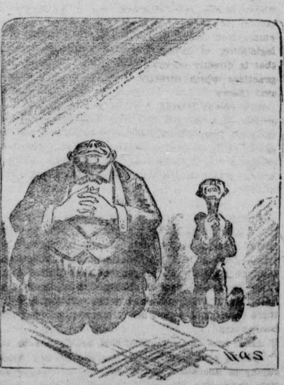
FAT, the boss, and SLUM, the slave, praying to same god.