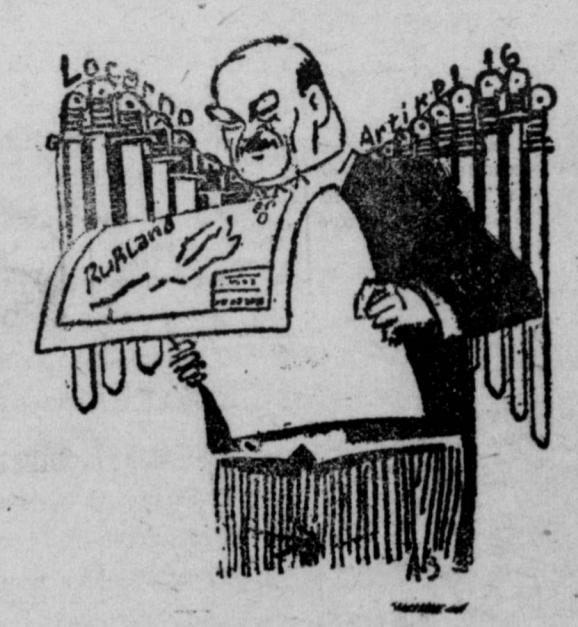
Stresemann: Apparently thru my agreement to article 16 of the covenant of the league of nations: whenever one country of this league feels threatened by Russia the other states must support it by all means against peace.